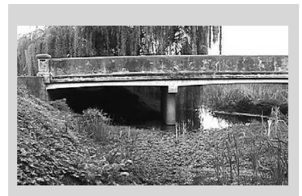
Fisher Creek, Santa Clara County