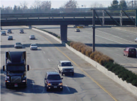
This is a concrete barrier with paving to the face of the barrier and landscaping in the median.

Existing median planting, mostly oleander shrubs, were planted in California beginning in the 1950's and have become an asset to the Department and the communities in which they grow. Median plantings provide glare screening for headlights of oncoming traffic, provide greenery and flowers, and minimize the visual width of the roadway. When roadway-widening projects threaten the removal of these plantings, local communities often voice concerns for preservation of the planting.