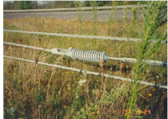
Three-Cable barrier installed in Oregon.