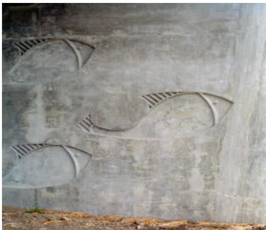
Pending approved design guidelines, graphics could become an integral part of concrete barrier design.

The next few pages of this report discuss textures that designers may use to address site specific, context sensitive solutions for concrete barriers. Specific textures will not be approved or disapproved but the depth, protrusions, angle of patterns, etc. will be governed by technical guidelines.