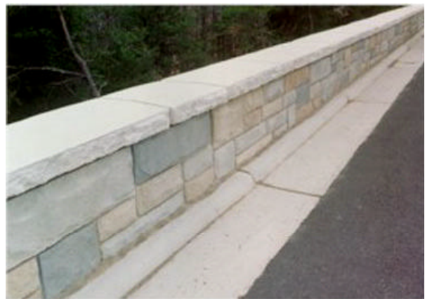
This guardwall is installed on the Federal highway system in the East Coast.