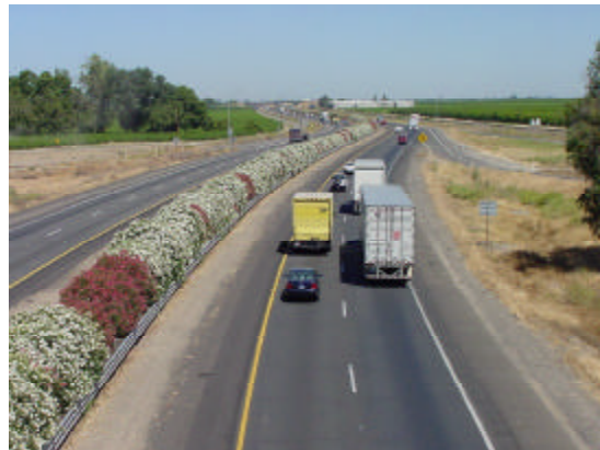
Median planting provides aesthetics in rural areas where no other highway planting exists.

The Department considers median planting to be an asset to the highway corridor and recommends removal only when other viable options are not available. Median barriers are being used when necessary and where feasible to protect these shrubs. Median barriers, regardless of system type, can be installed to preserve plantings, satisfying the desires of communities, and provide safety for maintenance workers and the traveling public. Options to median plantings should be considered, such as replacement of median planting with roadside planting along the right of way. The maintenance costs involved with median plantings are factors that must be considered.