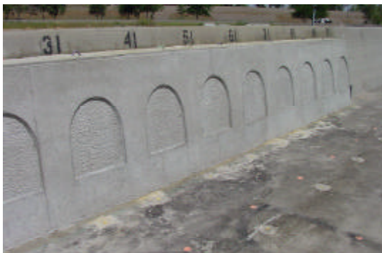
This is the mission arch design with beveled edge and light sandblast.

Geometric patterns inset into the face of the barrier 25mm or less. Chamfered or beveled edges to prevent vehicle snagging, especially on the downstream edges. Such patterns shall not feature long upward-climbing edges that could contribute to wheel climb.