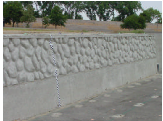
Shown here is rock cobble pattern with 610 mm of light sandblast on the bottom of the barrier.