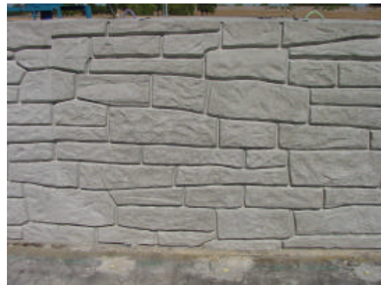
Dry stacked rock design was recently crash tested and received approval for use in California.

The results of each crash test are analyzed and a determination is made as to whether the textured barrier passes or fails established performance criteria - NCHRP Report 350 criteria, test level 3. From crash test results the Department has developed preliminary technical guidelines for the use of textures on concrete barriers. The Department will continue to perform additional crash tests to further expand these preliminary technical guidelines.