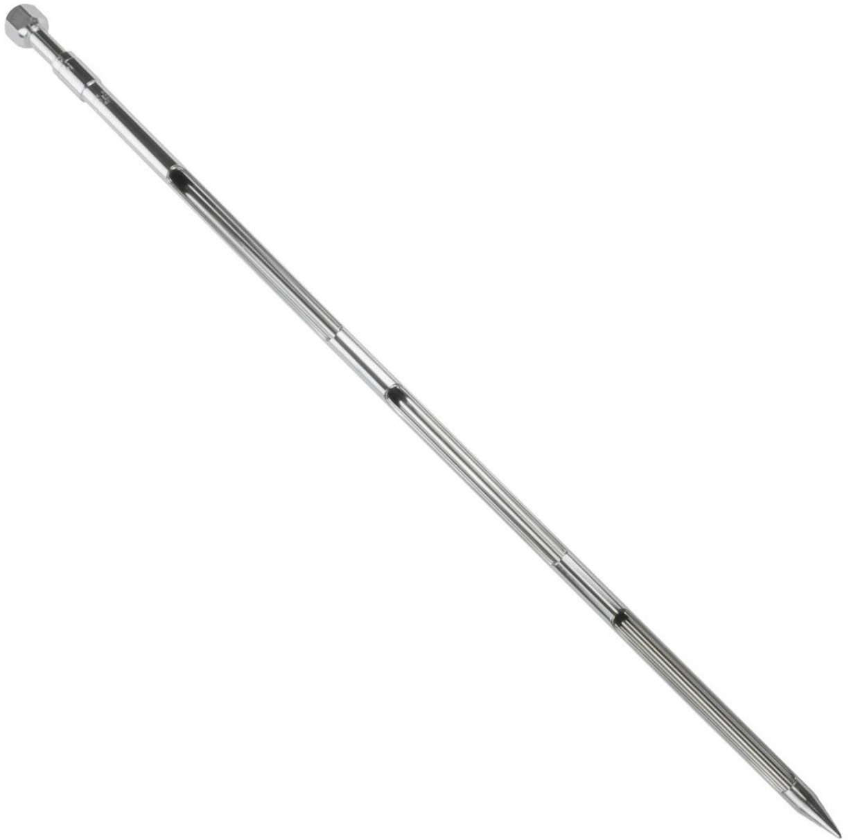
FIGURE 1. Sampling Device