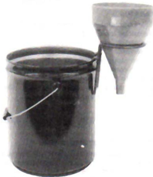
Figure 2: Grout Equipment