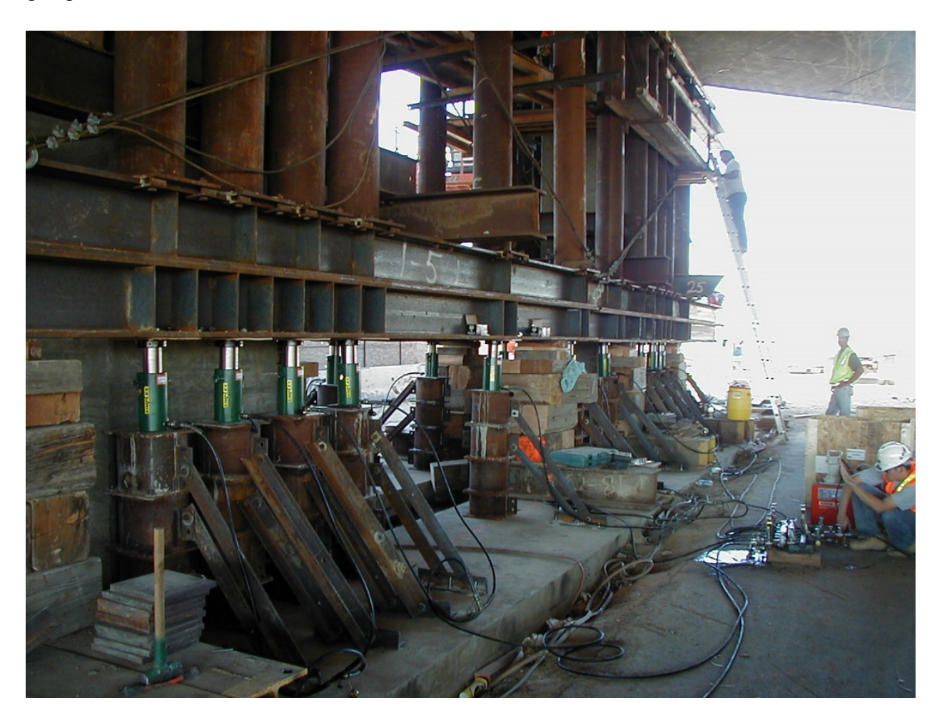
Figure 1. A fairly typical jacking system. Note the restraint of the cap beam to prevent unwanted movement.

The photographs below illustrate a jacking system used to jack a bridge superstructure. Various components of the system include jack supports, bracing, jacks, buildup, shims, gauges, etc.