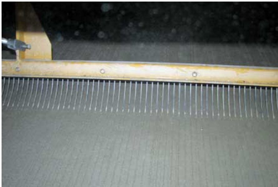
Figure No. 4: Example of the Tining Tool used for the Longitudinal Tining .