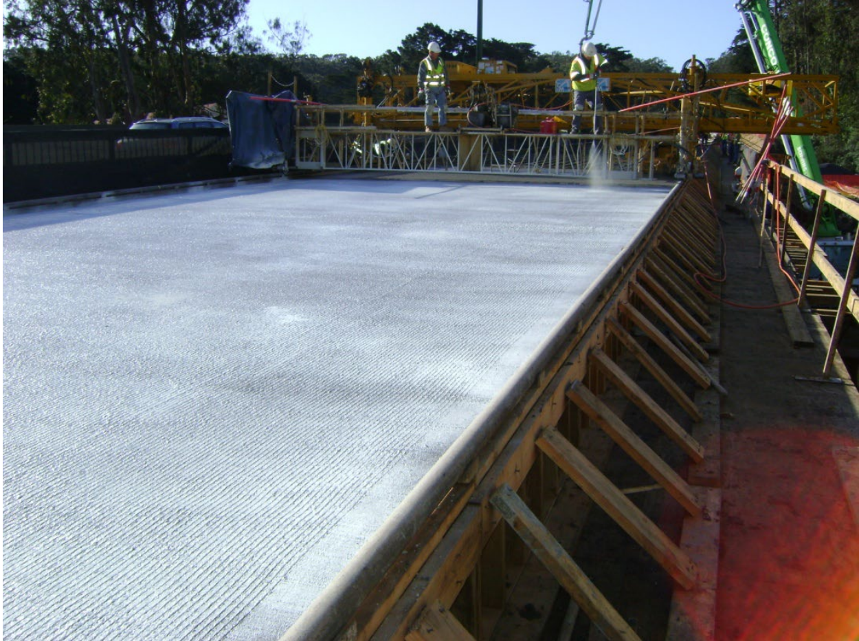
Figure No. 3: Example of a PCC Bridge Deck Using the Longitudinal Tining Option.