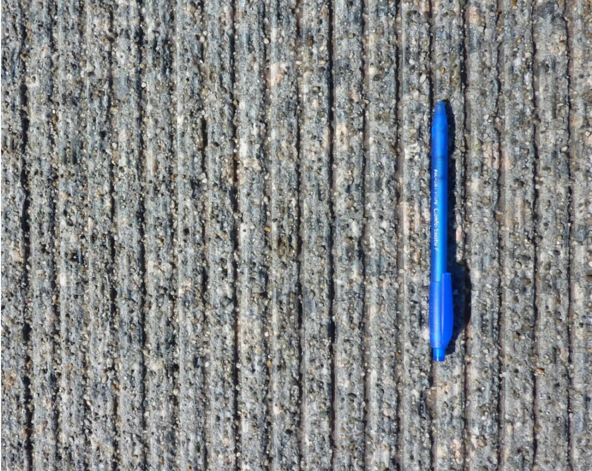
Figure No. 2: Example of a PCC Bridge Deck Using the Longitudinal Grinding and Grooving Option.