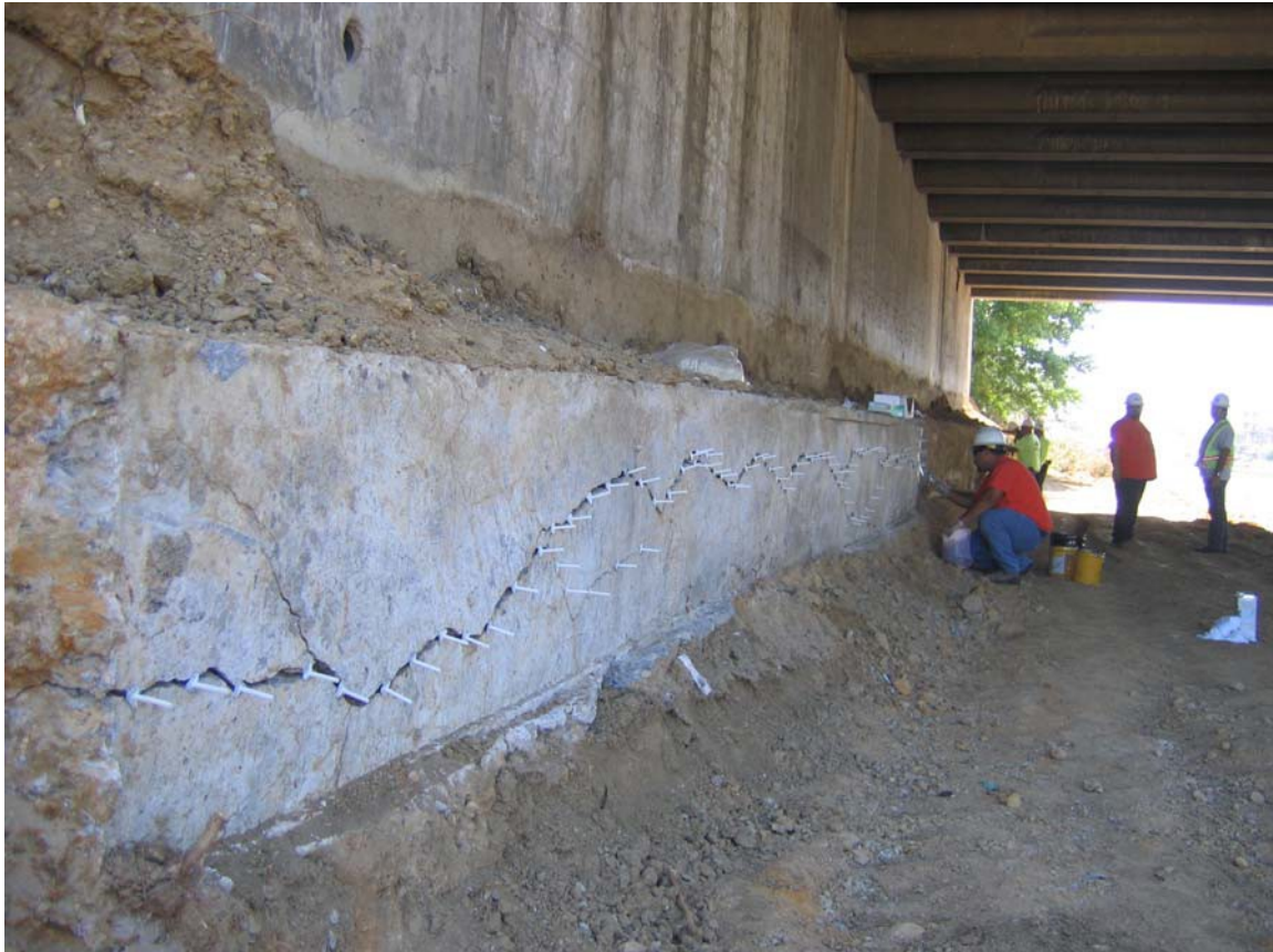
Figure 1. Installing Injection Ports

the contractor can use hot glue, from a hot glue gun, or a rapid setting epoxy to stick the injection ports directly into the crack. The contractor should be cautious when applying rapid setting epoxy or hot glue to the injection ports so as not to get any in the injection port or cover the opening at the end of the injection port. Once the ports are properly spaced and set the remaining length of the crack will need to be sealed.