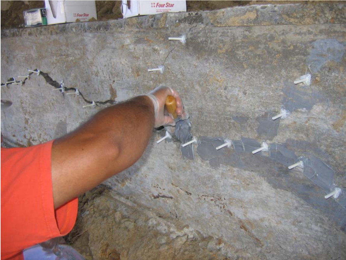
Figure 2. Sealing a Crack Between Injection Ports

of tribal knowledge in some cases, rubbing bees wax or paraffin over a leak may be sufficient to seal the leak. If this method does not work, place more rapid setting epoxy over the leak before continuing.