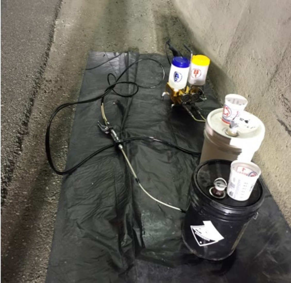
Figure 5. Epoxy Injection Pump, Injection Gun, and Two-Part Epoxy