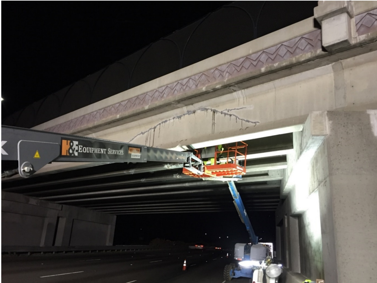
Figure 3. Epoxy Leaks on a Structural Element from Pressurized Epoxy Injection Work