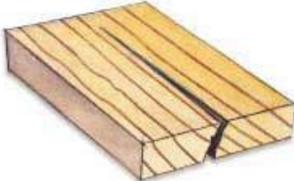
Figure A-3. Split