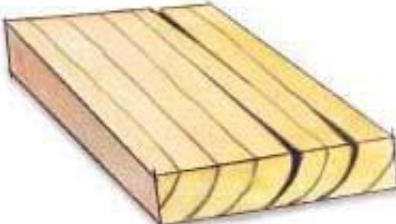
Figure A-2. Shake