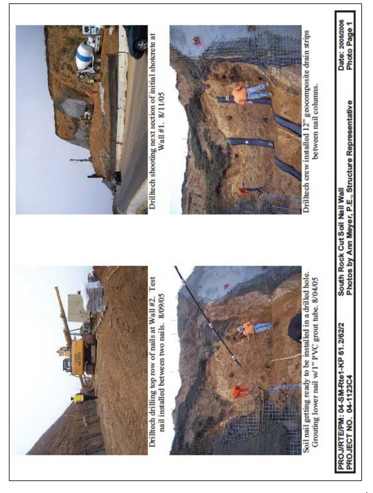
Figure H-4. Soil Nail Wall Construction 1.