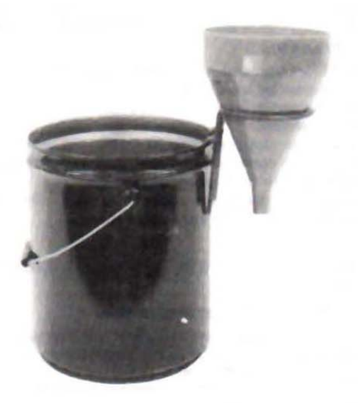
Figure 2: GROUT EQUIPMENT