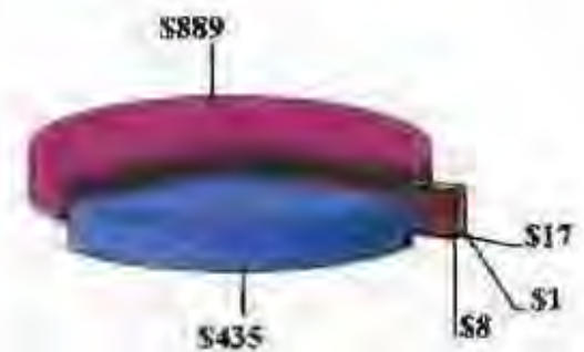
Program Costs (millions)

Of the remaining $26 million, $17 million is to be allocated for construction and right-of-way, and $1 million is planned for support, leaving a reserve of $8 million. This reserve is intended to cover cost changes, higher-than-anticipated bid results, any potential supplemental funds that may be needed, and arbitration settlements.