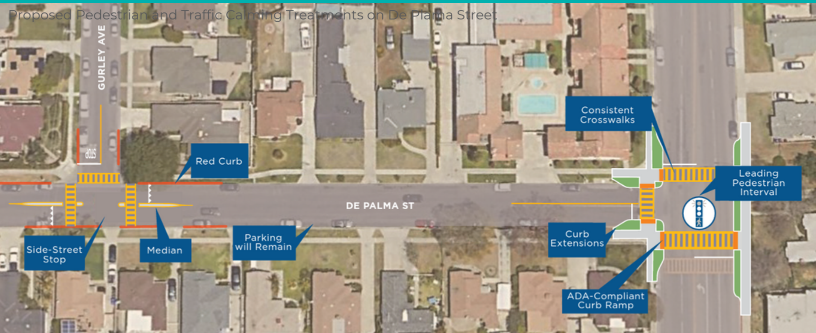
Proposed Pedestrian and Traffic Calming Treatments on De Palma Street

The following partners supported the City of Downey in this effort: