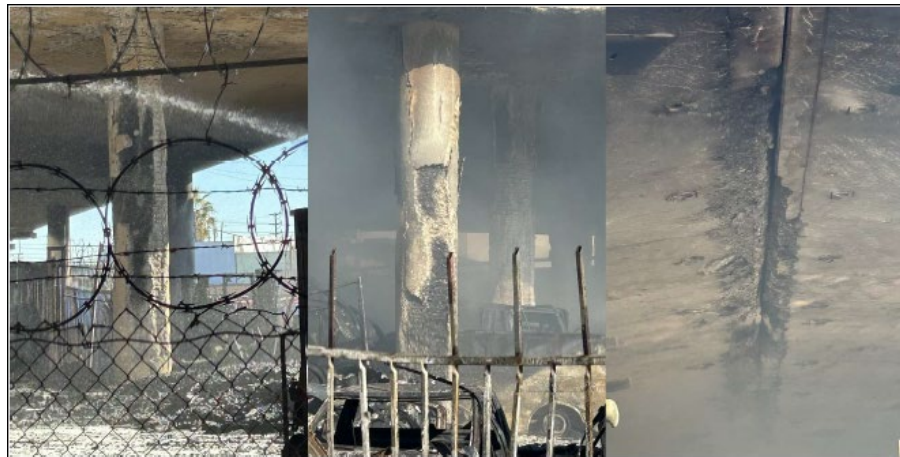
This Photograph Shows: Series of early morning photos (~7 AM). (Left and Center) Damaged and spalled bridge columns; rebar is exposed. (Right) Bottom of superstructure burned and spalled.