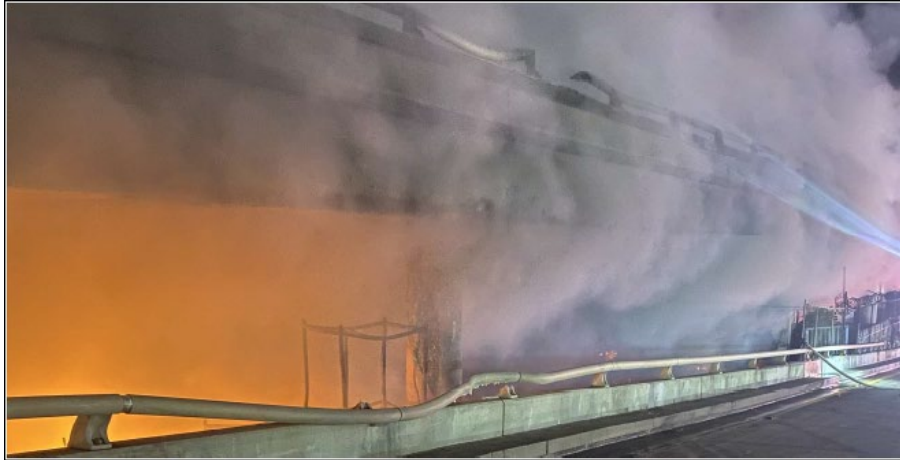
This Photograph Shows: Fire underneath the Santa Monica Viaduct in DTLA. Firefighters were putting out the fire in the early morning.