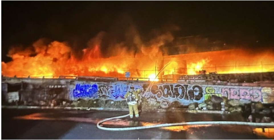
This Photograph Shows: Fire underneath the Santa Monica Viaduct in DTLA. Firefighters were putting out the fire in the early morning.