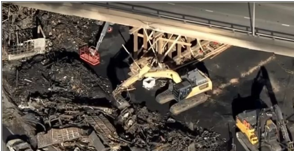
This Photograph Shows: Aerial photo of temporary shoring to support bridge columns. Equipment continues to remove hazardous waste/fire debris from the job site.