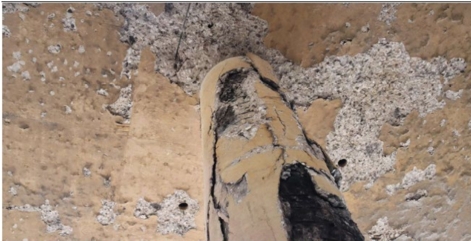
This Photograph Shows: View looking up at the spalled concrete on the bridge column and underside of the bridge superstructure.