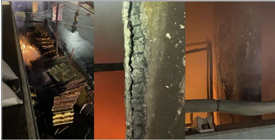
This Photograph Shows: (Left) View from above looking down at the fire and burning wood pallets. (Center) Photo of a spalled bridge column with rebars exposed. (Right) Photo of spalled concrete from bridge column.