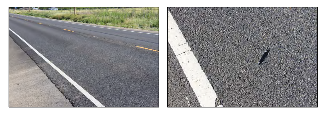
Figure 6.2: Marysville Evotherm, June 2011 (24 months).