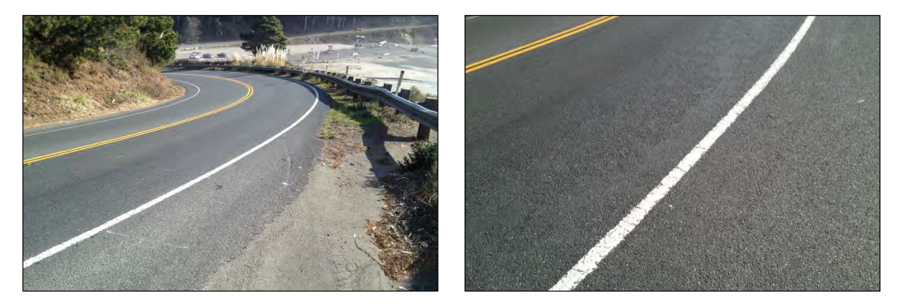
Figure 7.4: Mendocino Advera, December 2013 (42 months). Note raveling in outside wheelpath.