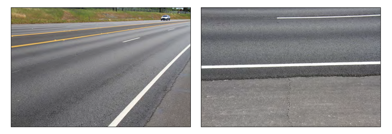
Figure 8.3: Auburn Evotherm, July 2012 (24 months). Note deterioration and reflected crack.