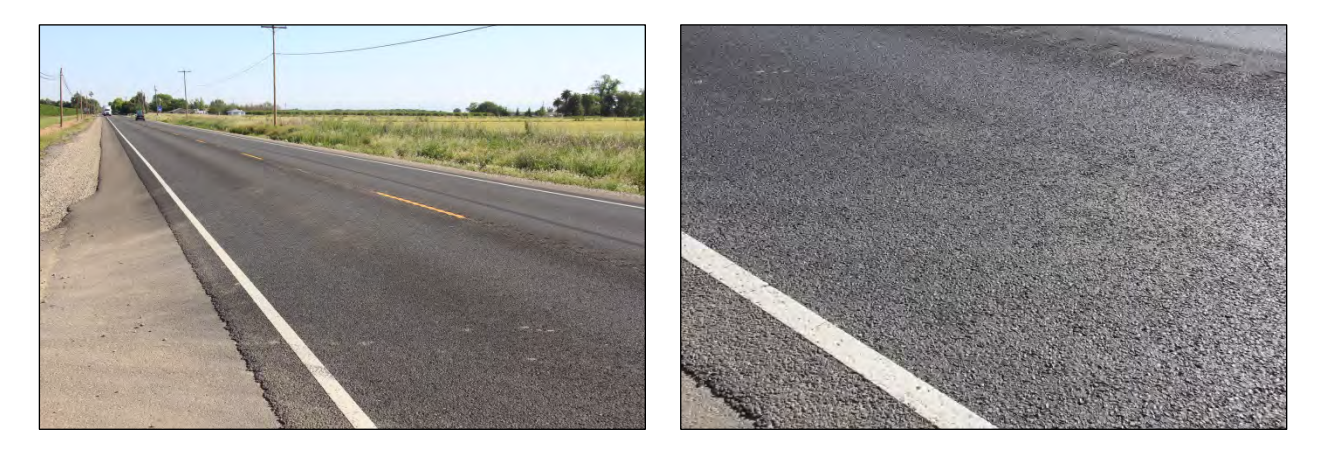
Figure 6.1: Marysville Evotherm, June 2009 (0 months).

No deterioration compared to the June 2009 baseline measurements was noted on the section after 24 months of traffic, indicating that frequent and aggressive turning movements by large agricultural equipment is unlikely to negatively influence warm-mix asphalt surfacings.