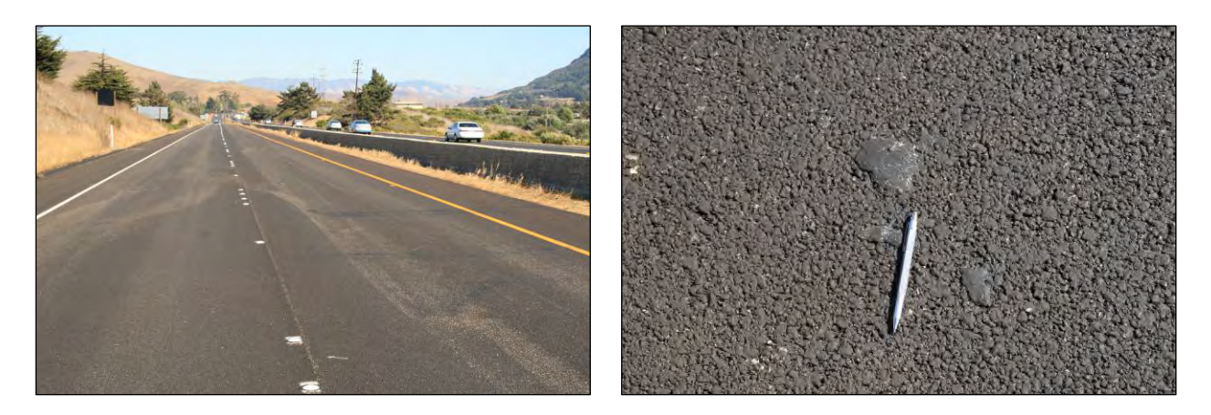
Figure 3.8: Morro Bay Evotherm, May 2007 (0 months).