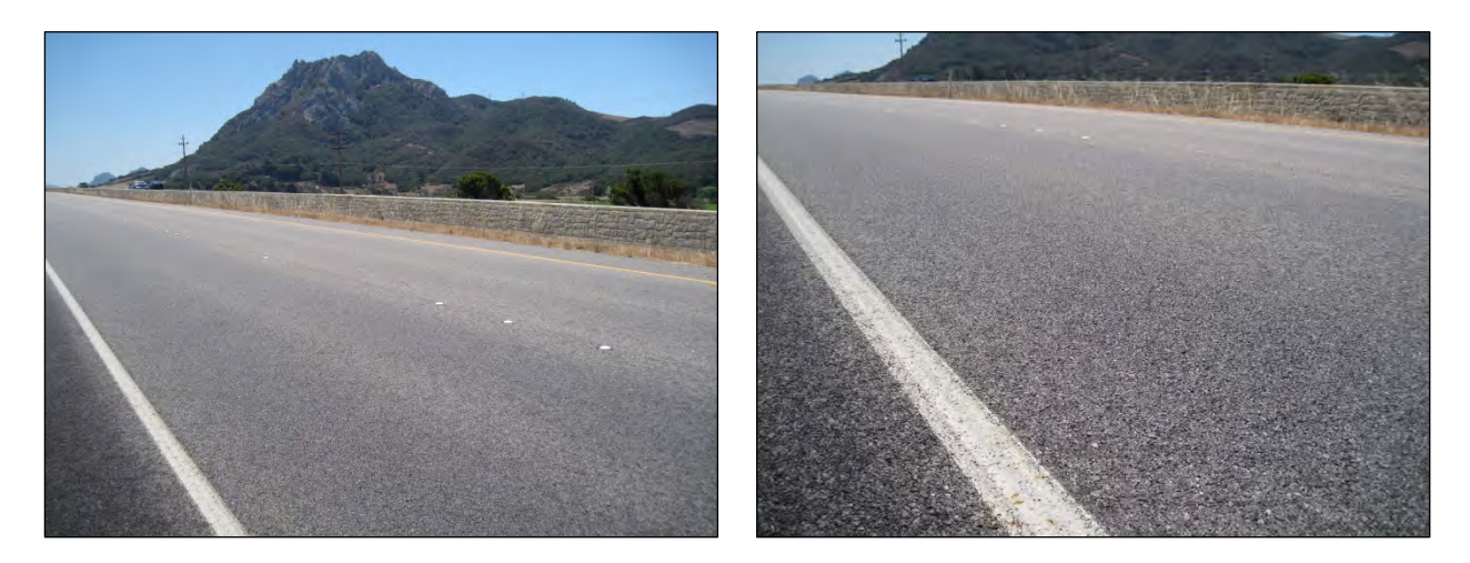
Figure 3.7: Morro Bay Advera, June 2013 (73 months).