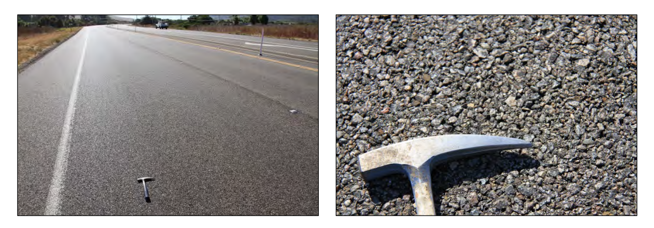
Figure 3.10: Morro Bay Evotherm, May 2012 (60 months), track marks no longer visible.