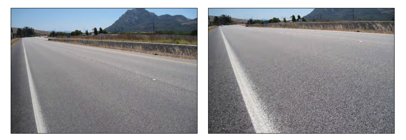
Figure 3.11: Morro Bay Evotherm, June 2013 (73 months).