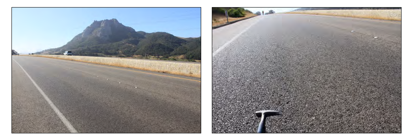
Figure 3.6: Morro Bay Advera, May 2012 (60 months), track marks no longer visible.