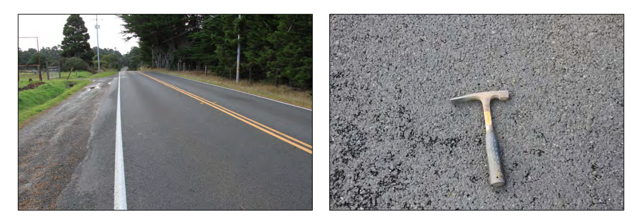
Figure 4.2: Point Arena Evotherm, November 2010 (23 months).