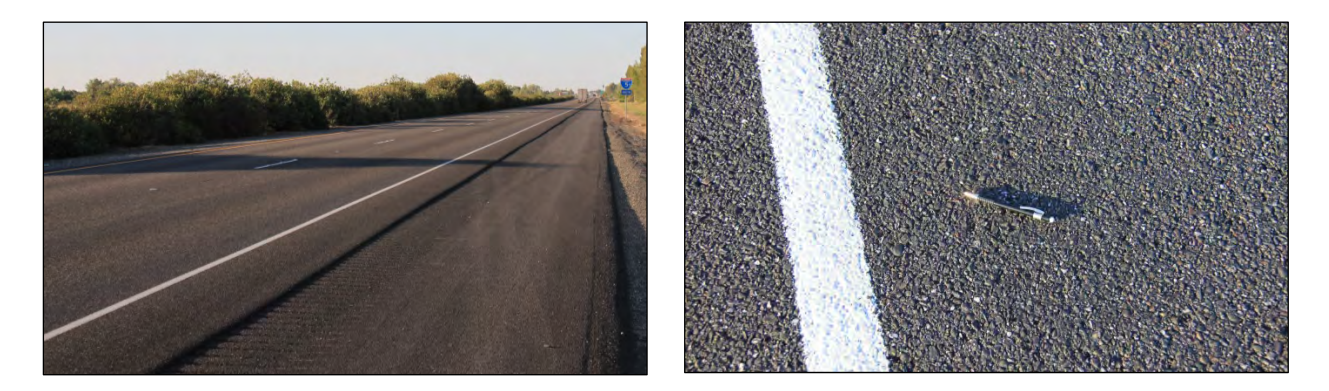
Figure 5.3: Orland Evotherm, June 2009 (1 month).