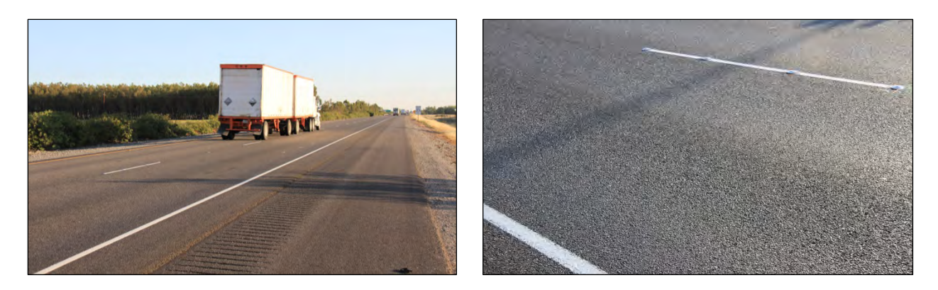
Figure 5.4: Orland Evotherm, June 2011 (24 months). Note ruts in wheelpath.