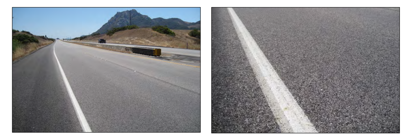
Figure 3.15: Morro Bay Sasobit, June 2013 (73 months).