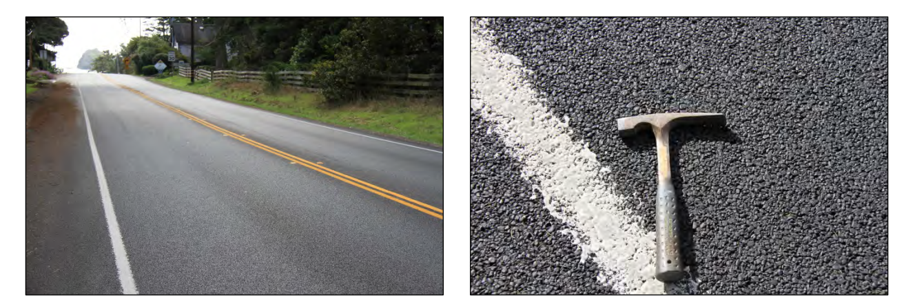
Figure 7.7: Mendocino Rediset, July 2010 (0 months).