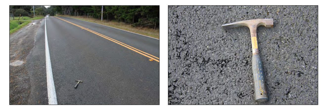
Figure 4.1: Point Arena Evotherm, December 2008 (3 months).

No deterioration compared to the December 2008 baseline measurements was noted on the sections after 54 months of traffic. The number and severity of the longitudinal cracks did not appear to have increased since the June 2012 visit. Drainage through the OGFC was still effective.