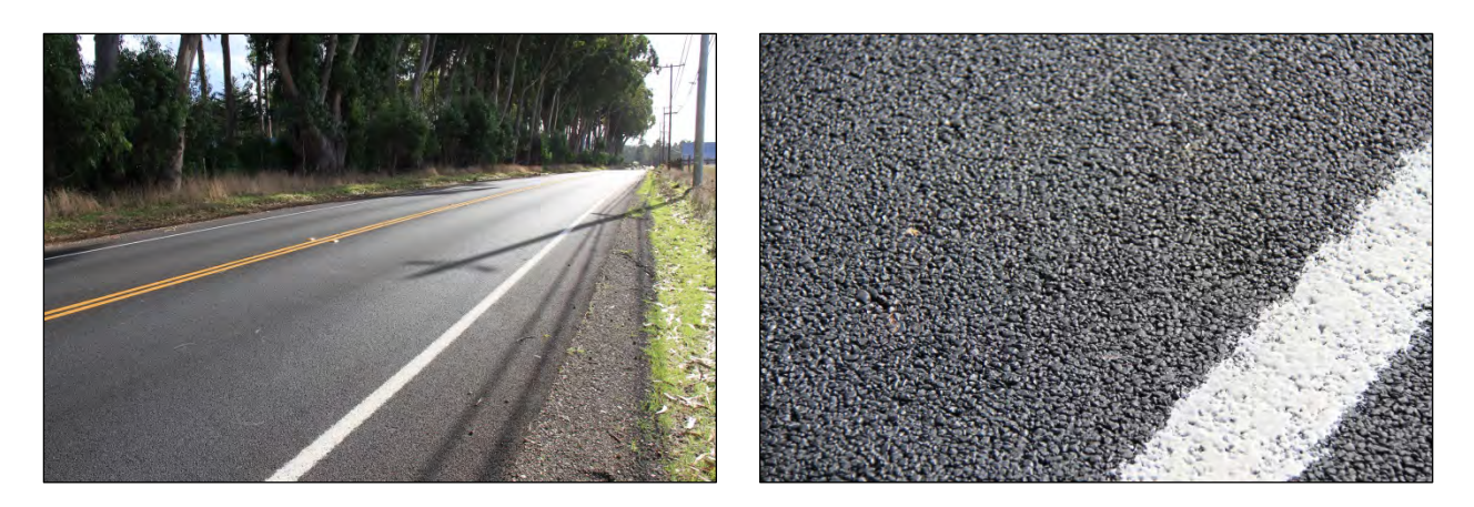
Figure 7.3: Mendocino Advera, July 2010 (0 months).