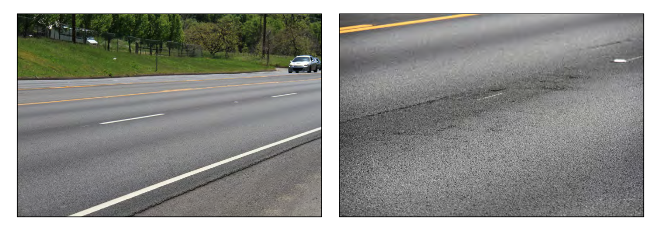
Figure 8.2: Auburn Evotherm, August 2010 (0 months). Note segregation and open joint.