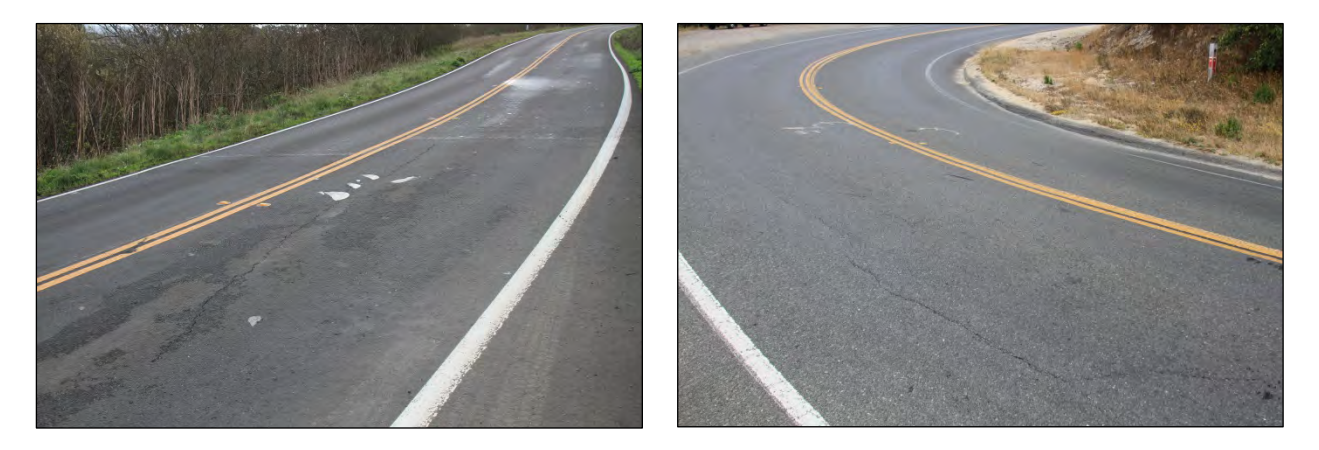
Figure 4.3: Point Arena Evotherm, November 2010, showing longitudinal cracks.