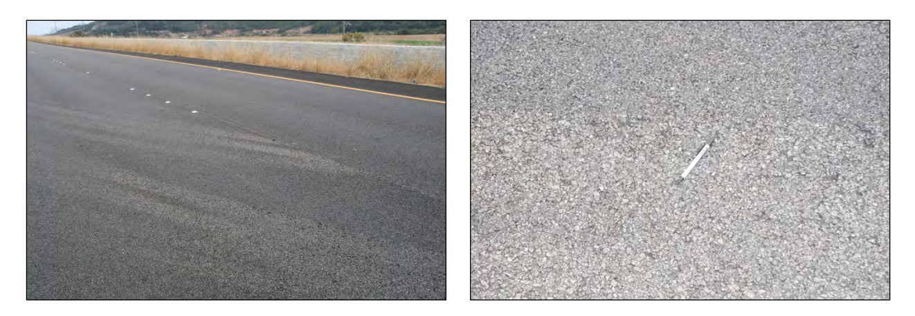
Figure 3.13: Morro Bay Sasobit, May 2007 (0 months), track marks.