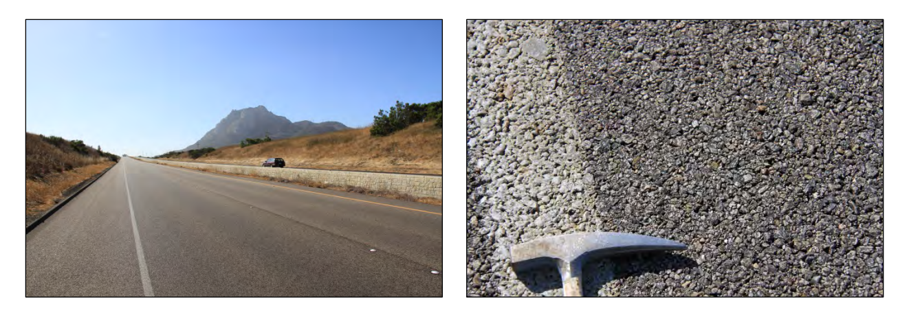
Figure 3.14: Morro Bay Sasobit, May 2012 (60 months), track marks no longer visible.