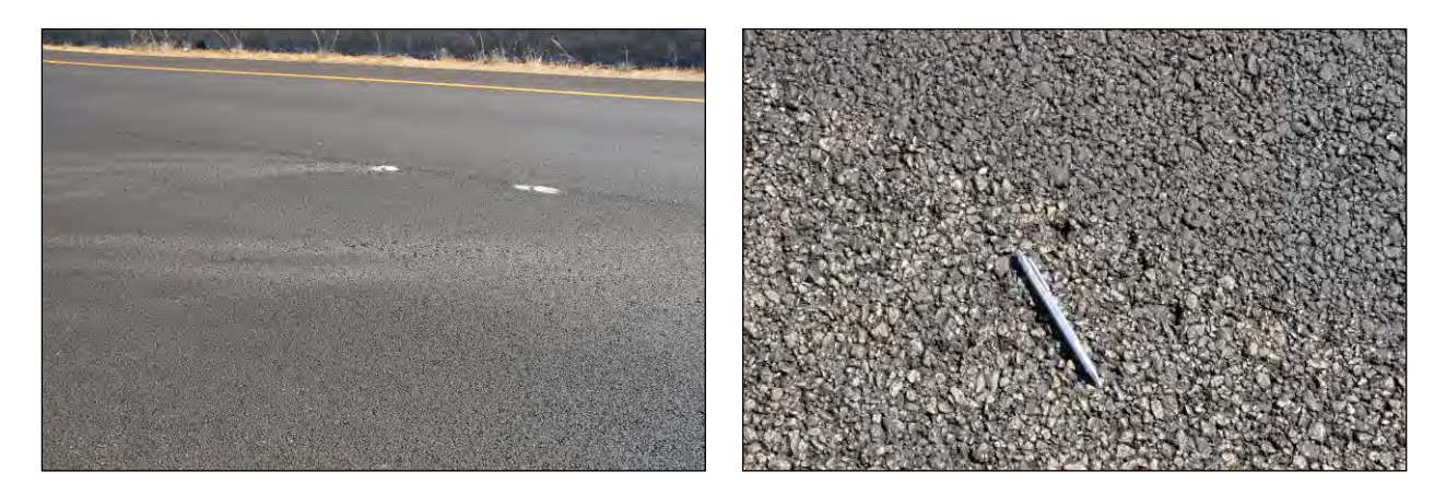
Figure 3.9: Morro Bay Evotherm, May 2007 (0 months), track marks.