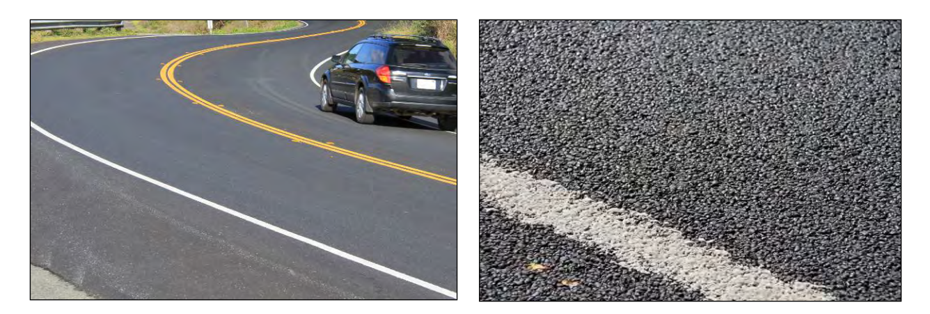
Figure 7.6: Mendocino Gencor, December 2013 (42 months).