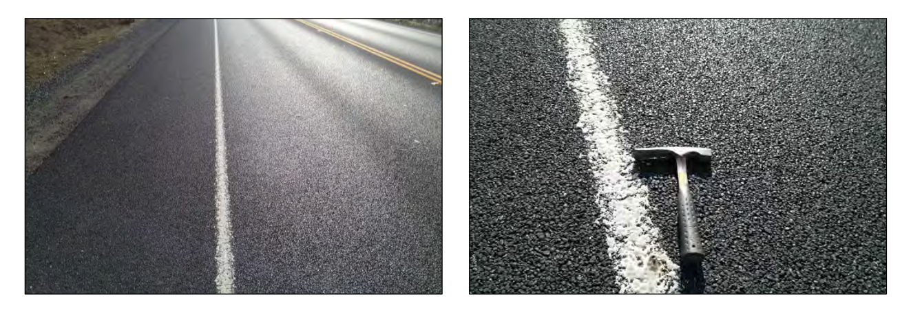
Figure 7.8: Mendocino Rediset, December 2013 (42 months).