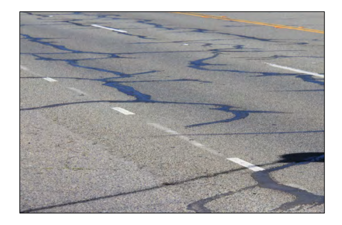
Figure 8.1: Auburn Evotherm, July 2010, one month prior to paving.

Reflected transverse cracking and some minor raveling in the outside wheelpath of the outside lanes was noted in some areas of the project. Given that no hot-mix control was available for comparison purposes, it was not clear whether these distresses were related to the warm-mix technology, to construction issues, or to other factors. No further deterioration compared to the August 2010 baseline measurements was noted.