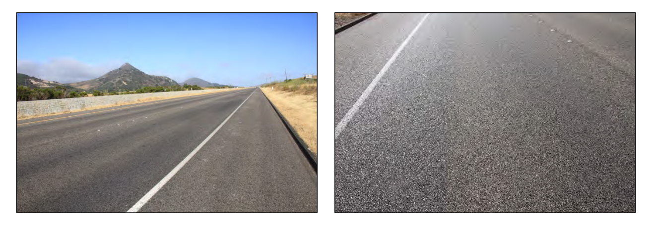
Figure 3.3: Morro Bay Control, May 2012 (60 months), track marks no longer visible.