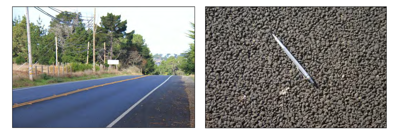
Figure 7.1: Mendocino Control, July 2010 (0 months).

No deterioration compared to the July 2010 baseline measurements was noted on the sections after 42 months of traffic. The raveling observed on the Advera section during the December 2012 visit had not deteriorated.