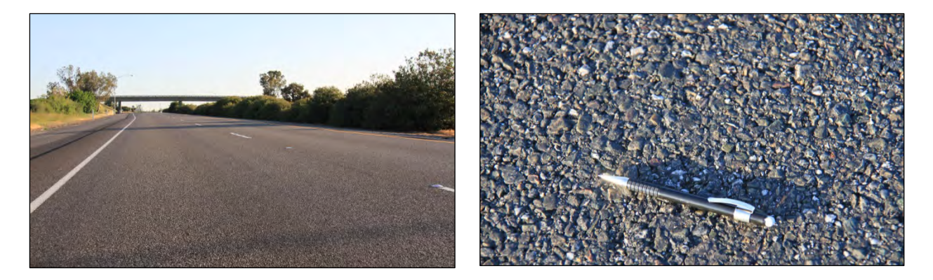
Figure 5.1: Orland Control, June 2009 (1 month).

No additional rutting was measured on the sections after a further six months of traffic and no other deterioration compared to the June 2009 baseline measurements was noted on the sections.