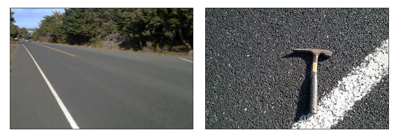
Figure 7.2: Mendocino Control, December 2013 (42 months).