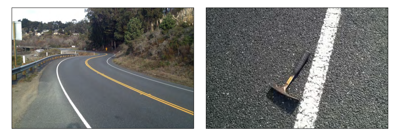
Figure 7.5: Mendocino Gencor, July 2010 (0 months).