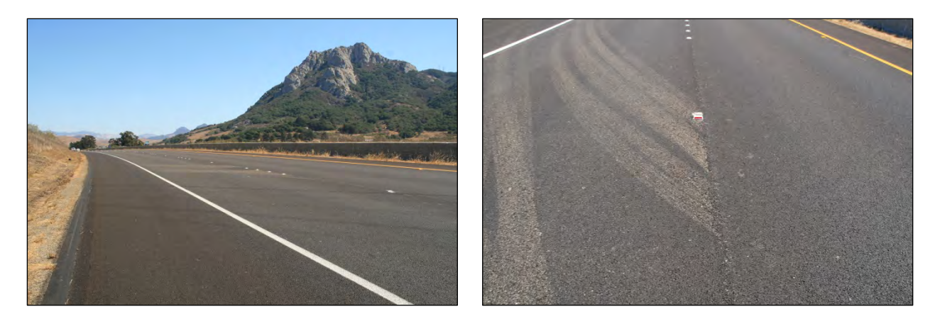
Figure 3.5: Morro Bay Advera, May 2007 (0 months).