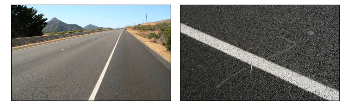
Figure 3.1: Morro Bay Control, May 2007 (0 months).

No deterioration compared to the May 2007 baseline measurements was noted on the sections after 73 months of traffic. Although the surface color of all sections was considerably lighter compared to new asphalt, the surface was still in very good condition and only minor stone loss, consistent with the age of the surface, was observed. Permeability through the open-graded friction course also remained effective on all sections (Figure 3.16).