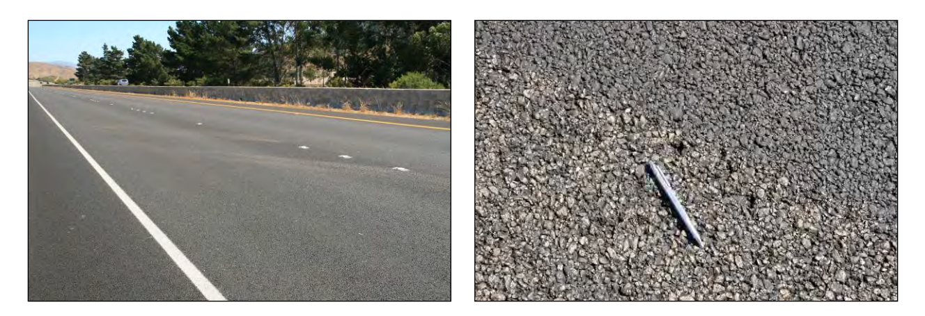
Figure 3.2: Morro Bay Control, May 2007 (0 months), track marks.