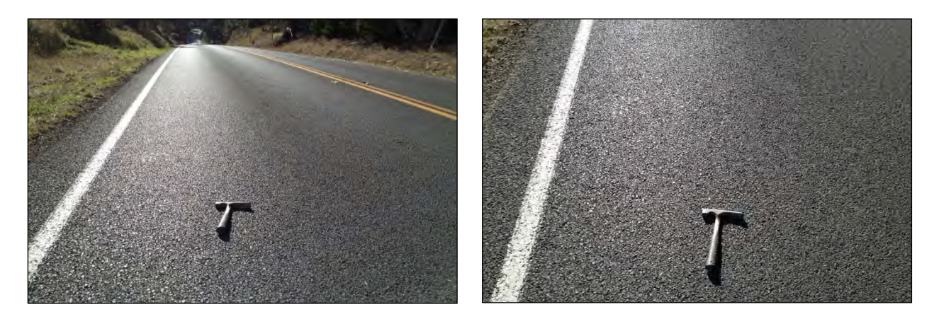
Figure 4.4: Point Arena Evotherm, December 2013 (54 months).