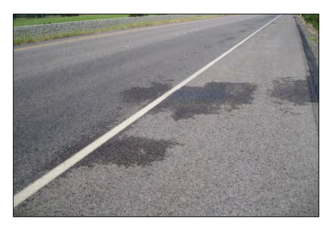
Figure 3.16: Morro Bay Sasobit, June 2013 (73 months), showing effective drainage.