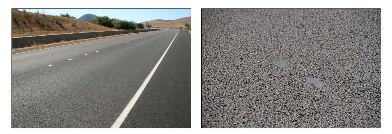
Figure 3.12: Morro Bay Sasobit, May 2007 (0 months).