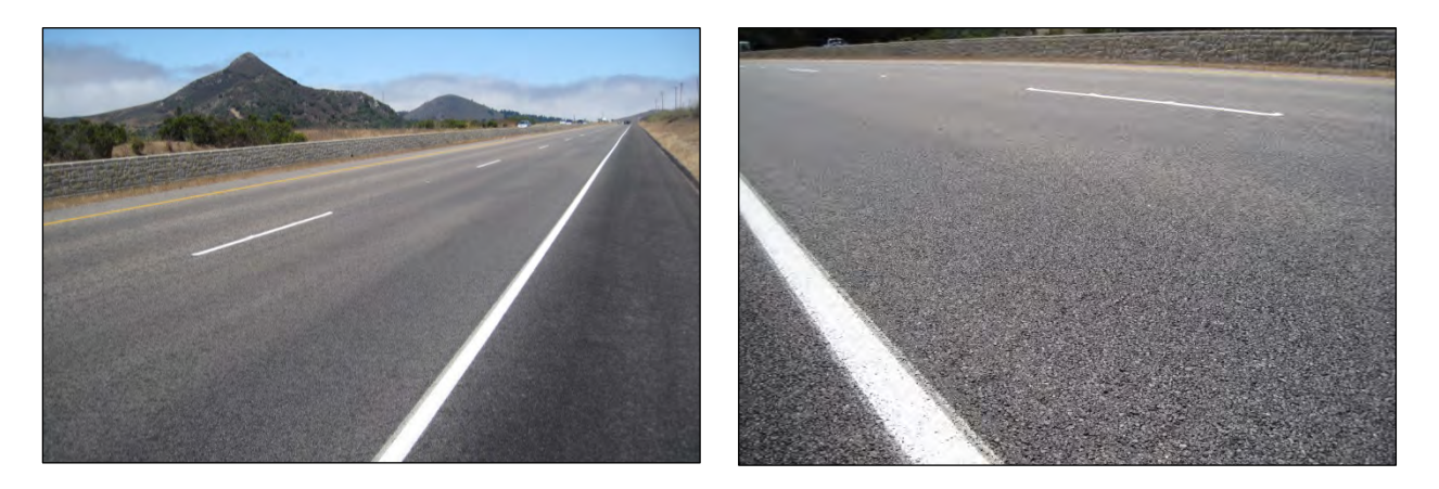
Figure 3.4: Morro Bay Control, June 2013 (73 months).