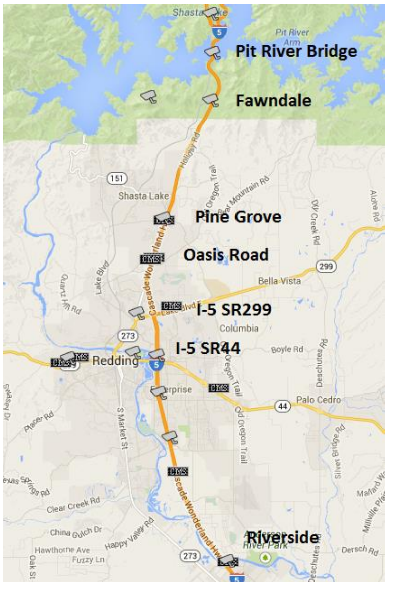
Figure 1: Map of I-5 near Fawndale

On northbound I-5 north of Redding, CA, when chain controls are in place, trucks are required to chain up near Fawndale. Figure 1 shows a map of the area and includes CCTV and CMS locations.