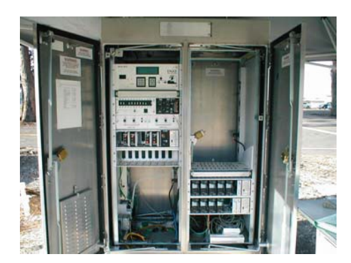
ITS 340 Cabinet with 2070 Controller