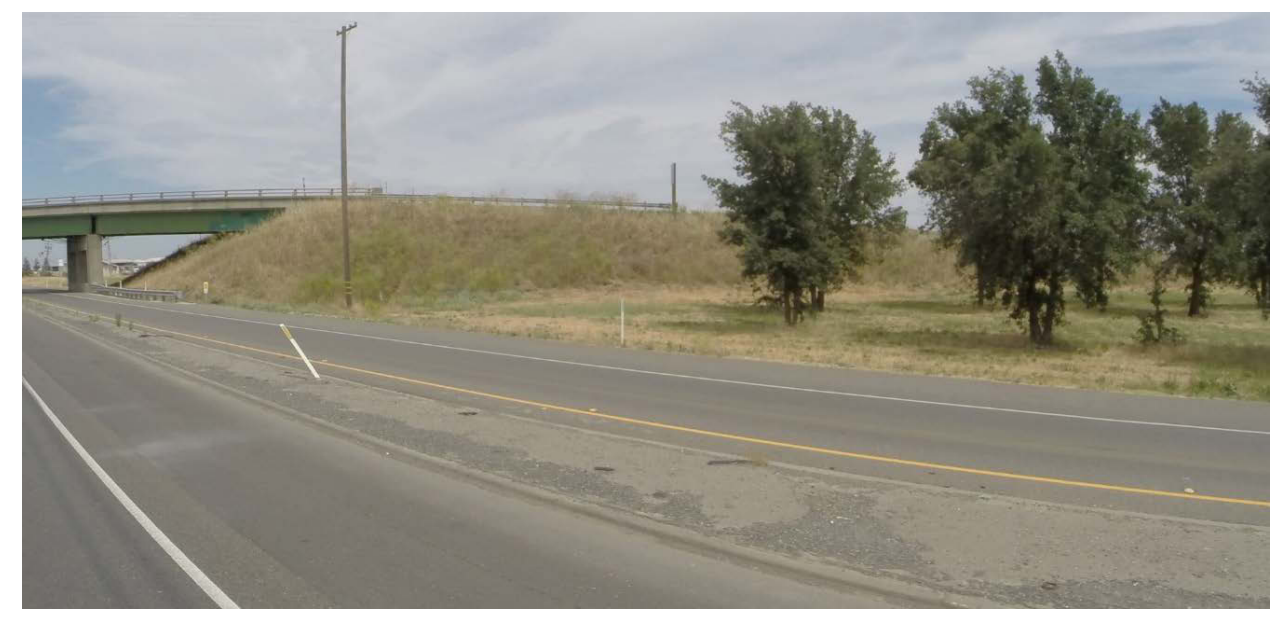
Figure 4.11: Example of slopes not mowed

The AEBI is a specialized mower, and many maintenance yards do not have access to one; therefore, slopes are often left un-mowed. The slopes shown in Figure 4.11 are examples of such areas, which are fairly common. If an RCM can be used successfully, these slopes would be mowed regularly.