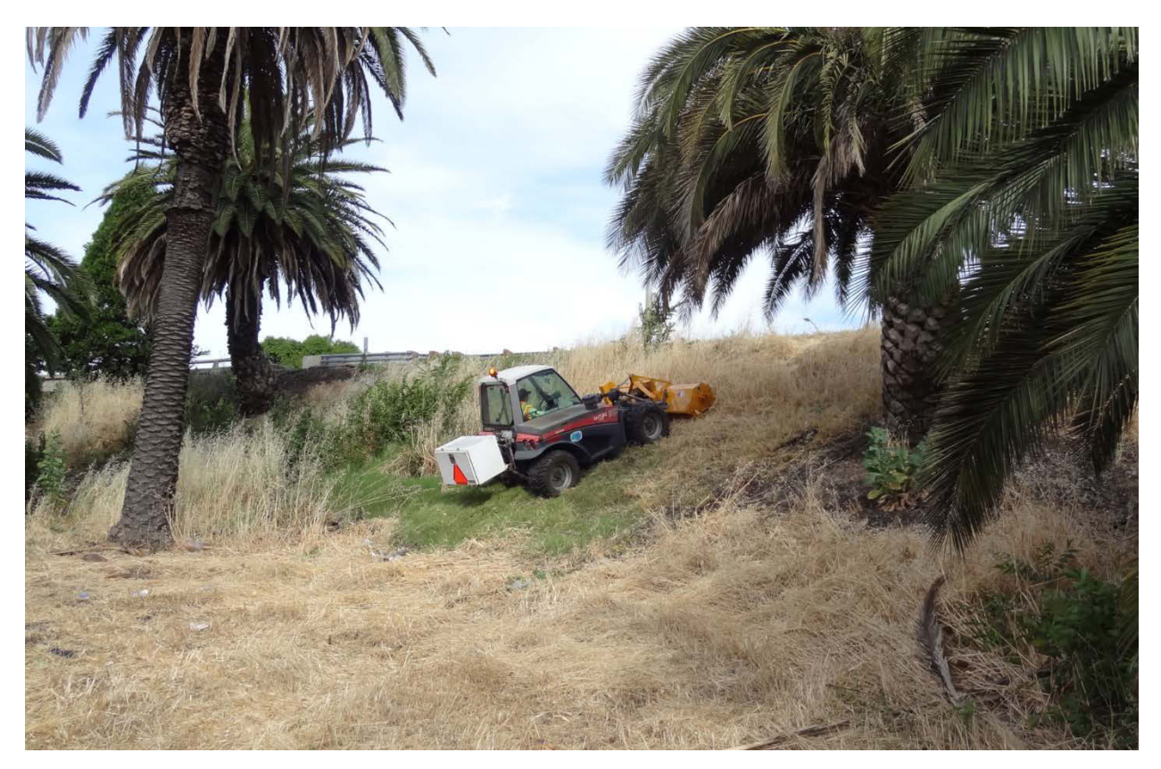
Figure 4.5: AEBI TT270 used by the Sunrise crew

The Traxx would most likely also be unable to negotiate the wood chip slope that stopped the AEBI; however, the Traxx should be tested under these conditions. The metal-cleated tracks of the Traxx allow it to negotiate typical 2:1 (27°) slopes more aggressively than the AEBI, so it will potentially have a higher mowing rate on the steeper sections of the slopes. The Traxx can be outfitted with spikes, which will greatly enhance traction but disturb the ground. Based on observations of the two machines, the Traxx will outperform the AEBI on slopes at 2:1 (27°) or greater, especially when working around obstacles.