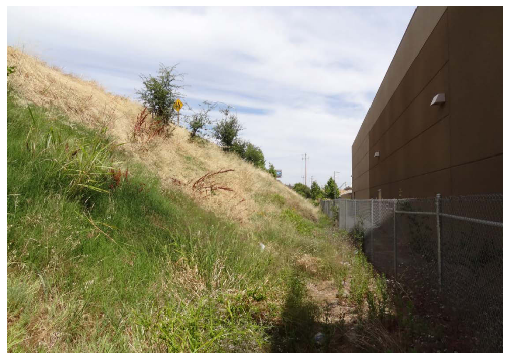
Figure 4.12: Slope measuring nearly 1:1 (45°) (SR 50 and 65<sup>th</sup> St, SE quadrant) next to a commercial property

No demonstration of mowing in either of these areas was performed. The diagram in Figure 4.14 summarizes the slopes and other conditions in which an RCM would be recommended.