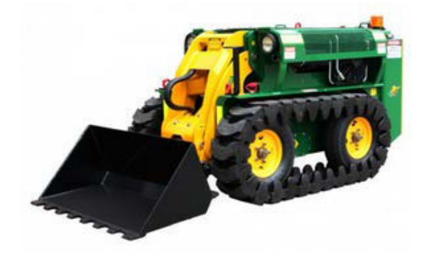
Figure 2.3: Kanga TR825 implement carrier

Caltrans has purchased two Kanga TR825 implement carriers (see Figure 2.3). These were purchased primarily for use as remote control loaders primarily for culvert cleaning operations. However, the vendor will be configuring the Caltrans machines with mower heads to expand their use, and the Kangas will potentially be used as slope mowers. The Kangas were not operating as mowers at the time this report was written; thus, they were not evaluated.