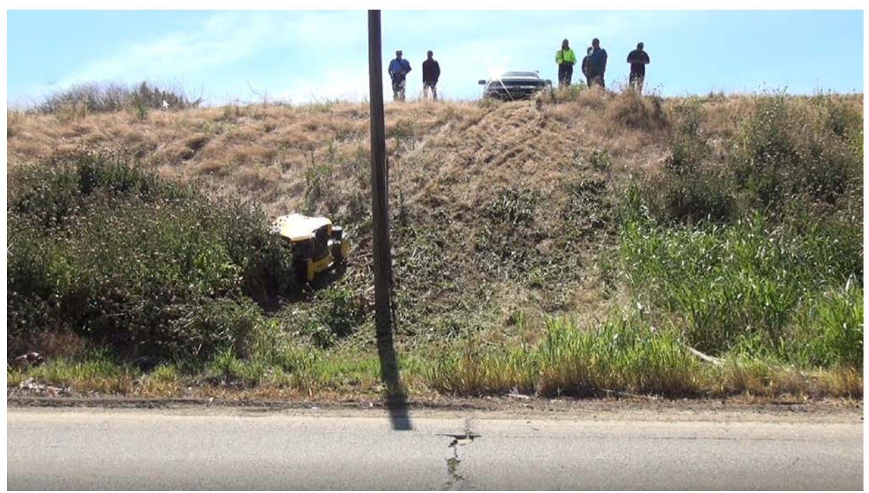
Figure 5.11: Spider mower tethered to truck at top of levee

Marysville and West Sacramento. Representatives from different levee districts were very interested in the capabilities of the Spider mower. They explained that the steepest slopes, which measure 2:1 (27°), are usually on the bank opposite the river channel. Figure 5.11 shows the Spider operating on such a bank. Mowing is required to allow mandatory visual inspection of levee integrity. Boom mowers are commonly used but have a limited reach.