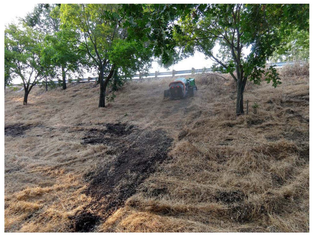
Figure 5.5: LV600 tested by researchers on 2:1 (27°) slope

floating the cutter head. The mower has to push against the rolling resistance of the cutter head. Lifting the cutter head slightly will reduce this resistance and reduce erosion when mowing up slope.