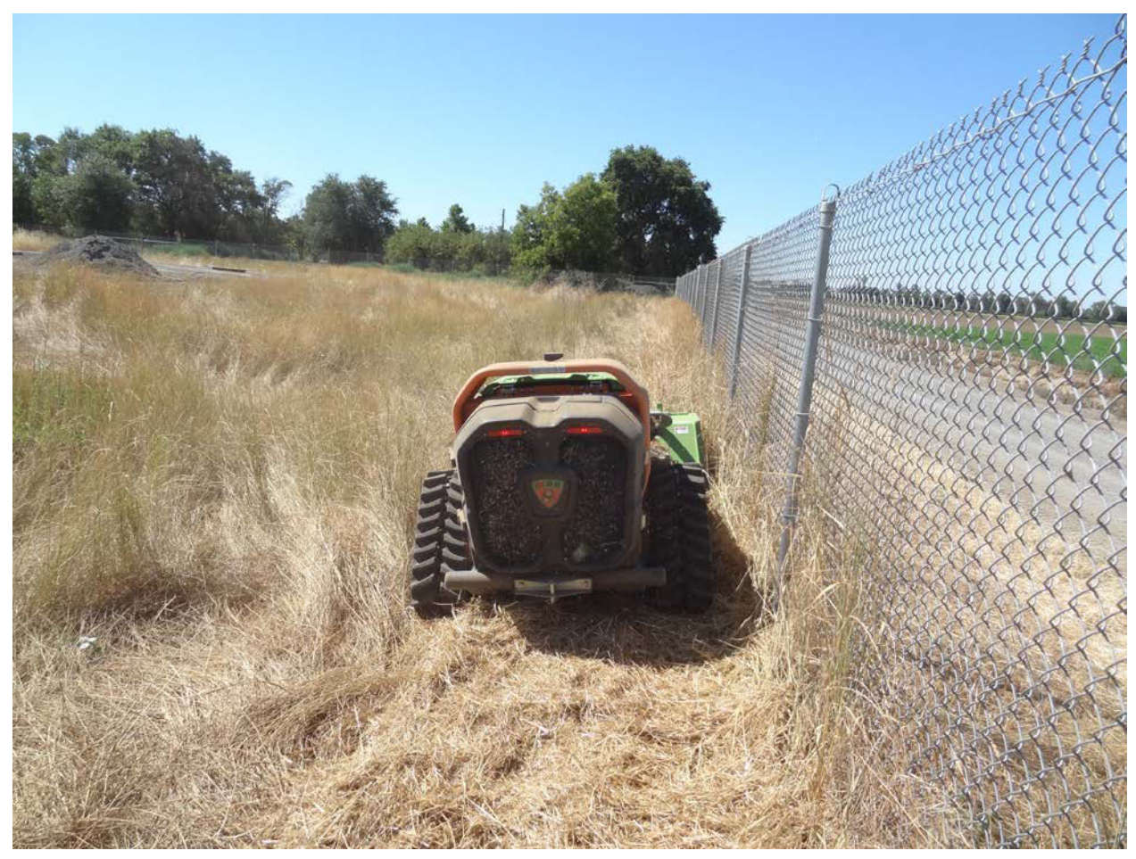
Figure 5.1: View showing the typical space between fence and mower

its maximum speed of about 5 mph. Mowing at speeds above 3 mph is not likely given the increasing chance of damaging equipment by running into hidden objects.