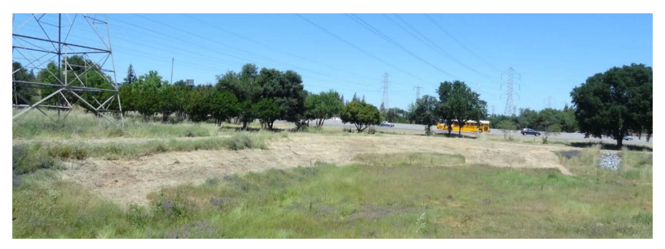
Figure 4.1: Timed mowing test area

The one negative anomaly observed during the demonstration was how, in one instance, the Traxx broke through the surface and tore holes into the ground. This occurred as the Traxx was mowing up a slope approaching 2:1 (27°). The weight of the machine was clearly transferred to the rear of the tracks, and once it broke through the surface crust, it could not maintain enough traction to move forward. The operator indicated that he normally attempts to drive the machine across steep slopes when possible. The operators emphasized that disturbed ground allows weeds to establish, which is problematic.