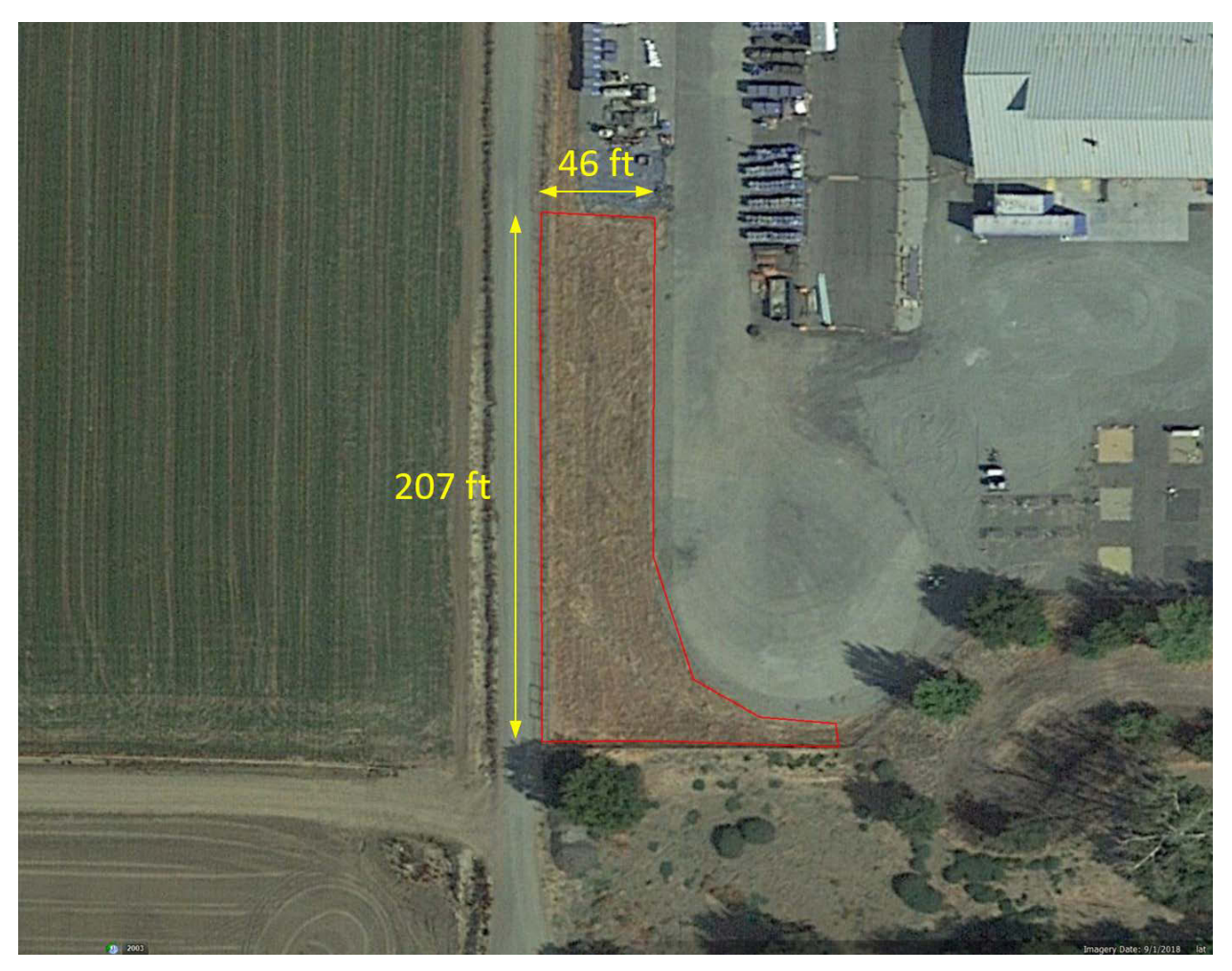
Figure 5.2: Plot view of timed mowing test (0.25 acre in 28 min)

An attempt to obtain a representative maximum speed was done by following the fence on the outside of the ATIRC facility. The surface was a gravel road with weeds growing on the shoulder against the fence. The smoother surface made it easier to steer the mower. The operator followed the mower within 15 ft and steered within a 6 in wide strip. One 90° turn was included.