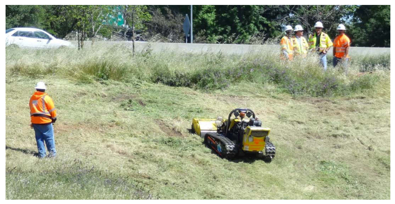
Figure 2.1: Demonstration of the Alamo Traxx configured as an RCM

The literature search found that most of the available information on RCMs is associated with commercial sites. Based on an internet search and discussion with vendors, the state-of-the-art technology is represented by machines that are widely available in the European market with manufacturers based in Italy, Germany, Denmark, and the Czech Republic. RCMs include mowers and multipurpose implement carriers and range in size from small, dedicated 25horse power (hp) mowers to large 140-hp systems weighing over 10,000 lb. Some RCMs are being developed in the United States, but they do not yet have the design refinements and market presence of the European machines. Five of the European designs are available through dealers in California. Two, including the Alamo Traxx (see Figure 2.1), are implement carriers and three are dedicated mowers.