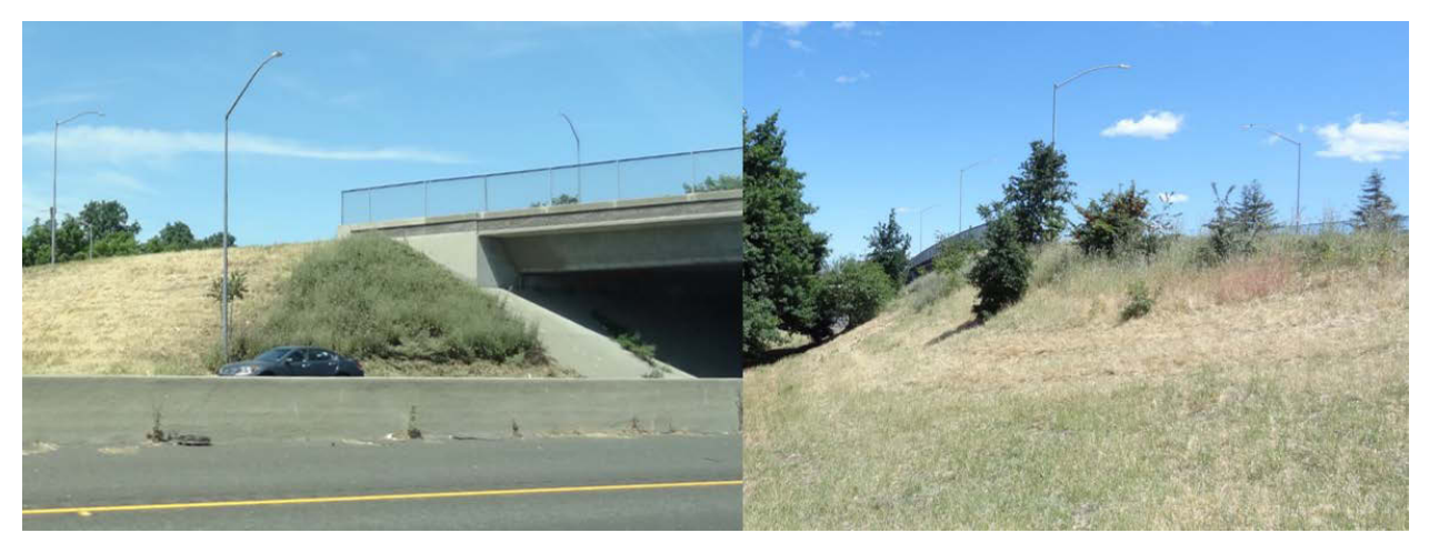
Figure 4.10: Areas that cannot be mowed with AEBI slope mower

The AEBI is a specialized mower, and many maintenance yards do not have access to one; therefore, slopes are often left un-mowed. The slopes shown in Figure 4.11 are examples of such areas, which are fairly common. If an RCM can be used successfully, these slopes would be mowed regularly.