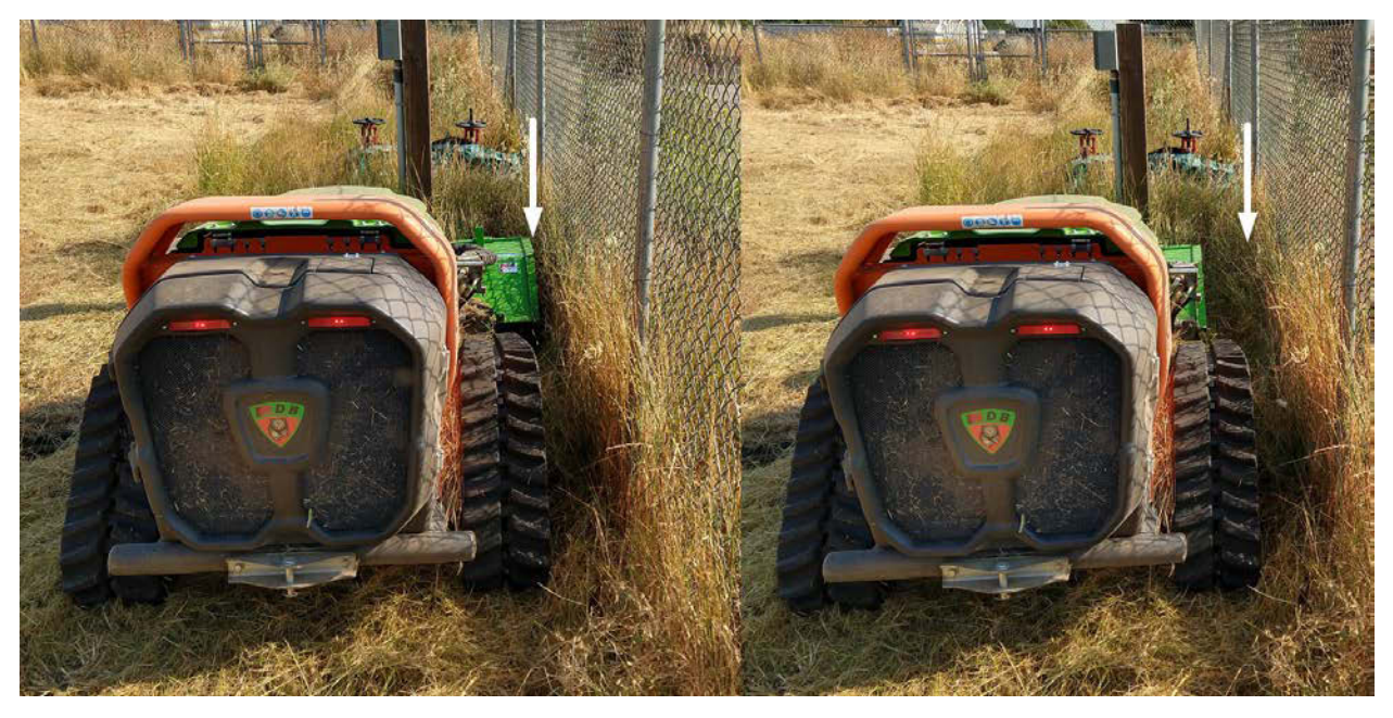
Figure 5.3: LV600 cutter head shift function