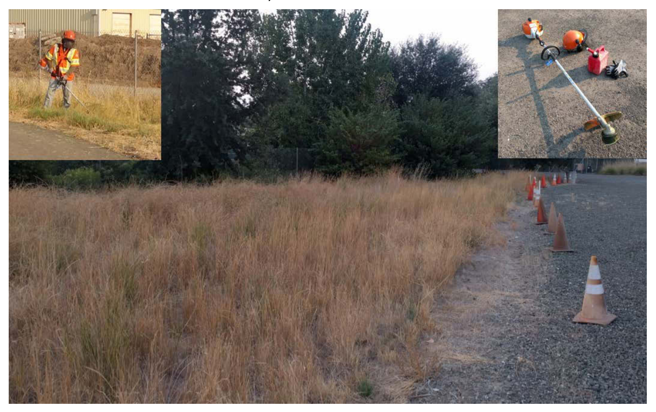
Figure 4.8: String trimmer mowing rate test area next to standard 28-inch cones

Based on the mowing rates obtained so far, an operator using a Traxx is at least four times faster than a worker with a string trimmer. In a roadside environment, the likelihood that some workers will need to use trimmers with steel blades to cut tougher weeds increases along with the potential for injury. The quality of an RCM cut is much better, and it will cut heavy brush. The mulching action of the trimmer is negligible. In addition to the strain on knees and back noted earlier, the engine vibration, noise, and fumes are obnoxious. String trimmers may be necessary to remove vegetation in some locations, but their use as "mowers" is extremely inefficient.