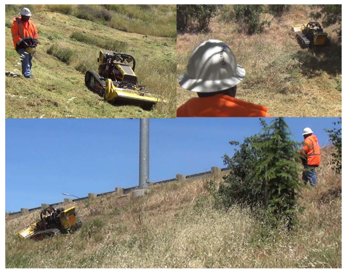
Figure 4.3: Typical operator location

During the testing and demonstration, the operator was never more than 100 ft from the Traxx. Figure 4.3 shows the more typical locations of an operator with respect to the machine. The Traxx operator's manual states that a minimum 100 ft separation should be maintained. It also states that the operator should be 300 ft away when in front of the machine. These indications appear conservative. Adherence to these dimensions is generally unfeasible. These distances can only be maintained in the most benign and ideal environments, such as a wide-open lawn. In a roadside environment, trees, shrubs, and tall grasses impede line of sight. Even in the case of a clear line of sight, an operator is at a severe disadvantage at longer distances. The operator must be able to see the work area and hear the machine. At a distance, gauging the overlap between mowing passes is difficult, and the operator will have to increase the overlap to avoid missing sections of grass, which reduces the mowing rate. Additionally, at far distances assessing objects in the path ahead of the machine becomes increasingly difficult. In this test case, no ejection of material from the cutter was observed, and the operator appeared safe. A reduced operating distance guideline will be required to operate the machine successfully.