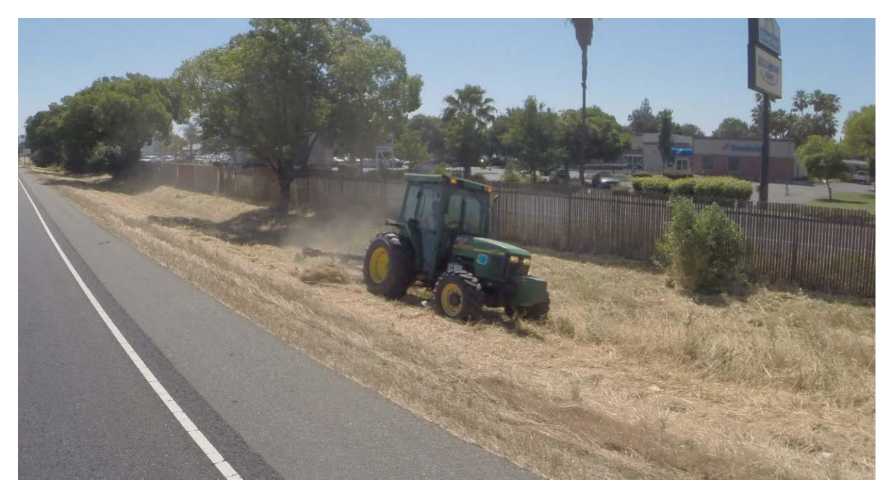
Figure 4.6: Tractor pulling a 9-ft-wide mower

One advantage in operating machines like the AEBI and a tractor over the RCM is that the operator can be enclosed in an air-conditioned cab with reduced exposure to dust. Another factor that should be considered is that large CMs are often driven on the shoulder or on surface streets when moving between locations. This reduces the need to trailer the mower.