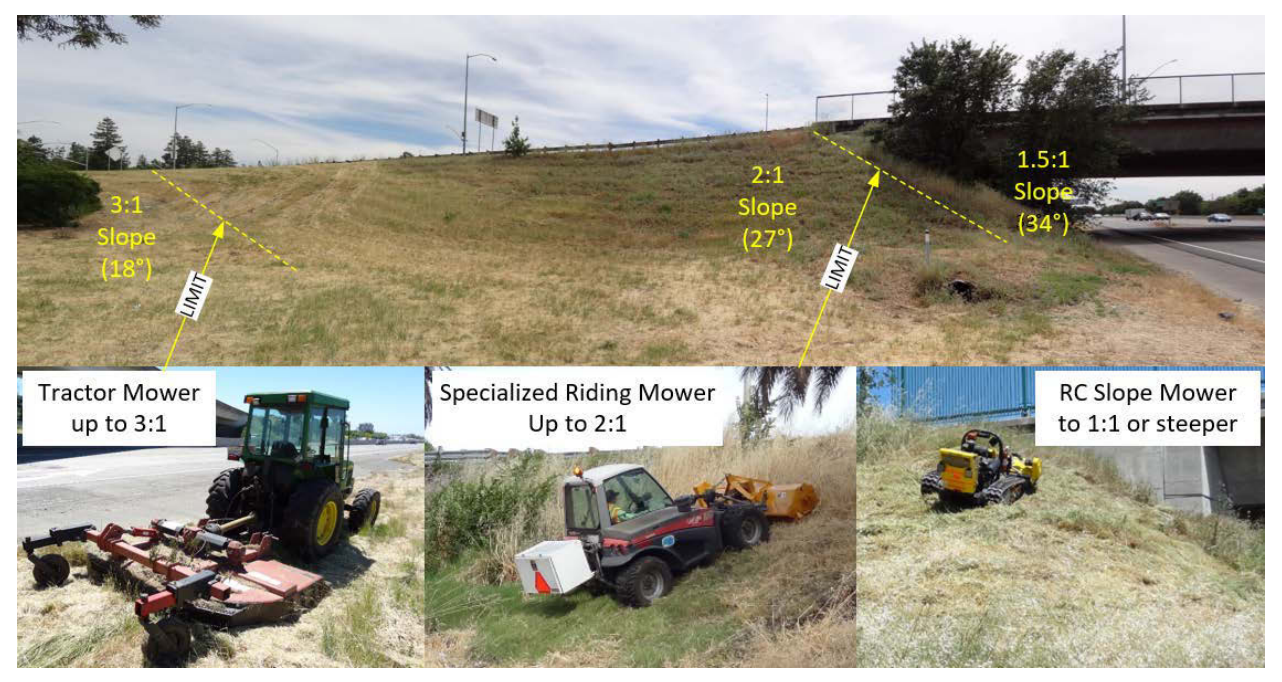
Figure 4.9: Typical configuration of roadside slopes

Based on observations, a 1.5:1 (34°) slope is never mowed except immediately next to a shoulder. Even the shallower slopes cannot be mowed if trees and other landscape features force the AEBI operator to maneuver around tight areas. Figure 4.10 shows the typically resulting weed growth under the overpass as well as grasses that will have to be mowed with string trimmers. These areas would best be mowed with an RCM.