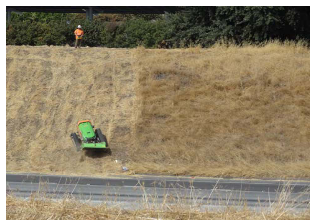
Figure 5.9: Backing up the slope with cutter head raised