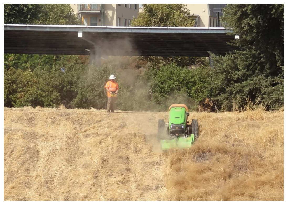
Figure 5.8 Mowing downward from top of slope

• The rate was reasonable given the limitations of mowing in one direction.