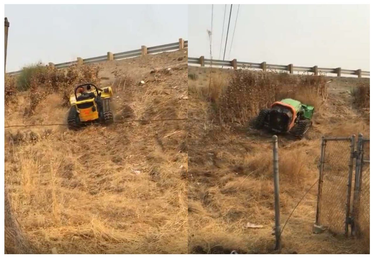
Figure 5.10: Traxx and LV600 operated in same area by one operator

Caltrans Traxx mowers were used to clean culverts and also experienced significant downtime. The researchers observed the Traxx once in Season 2 when a Caltrans operator operated a Traxx and the rented LV600 at the same location. The mowers are shown in Figure 5.10. The operator was experienced at operating the Traxx but not the LV600. Performance was similar between machines but it was not tested formally since this would require an operator to be proficient on both machines. Review of the video suggests that the Traxx has better traction due to the steel cleats on its rubber tracks. The LV600 did appear to be quieter, but this was not quantified. In this demonstration, the testing did not identify a limitation in mowing power of the Traxx. This has been noted previously by operators.