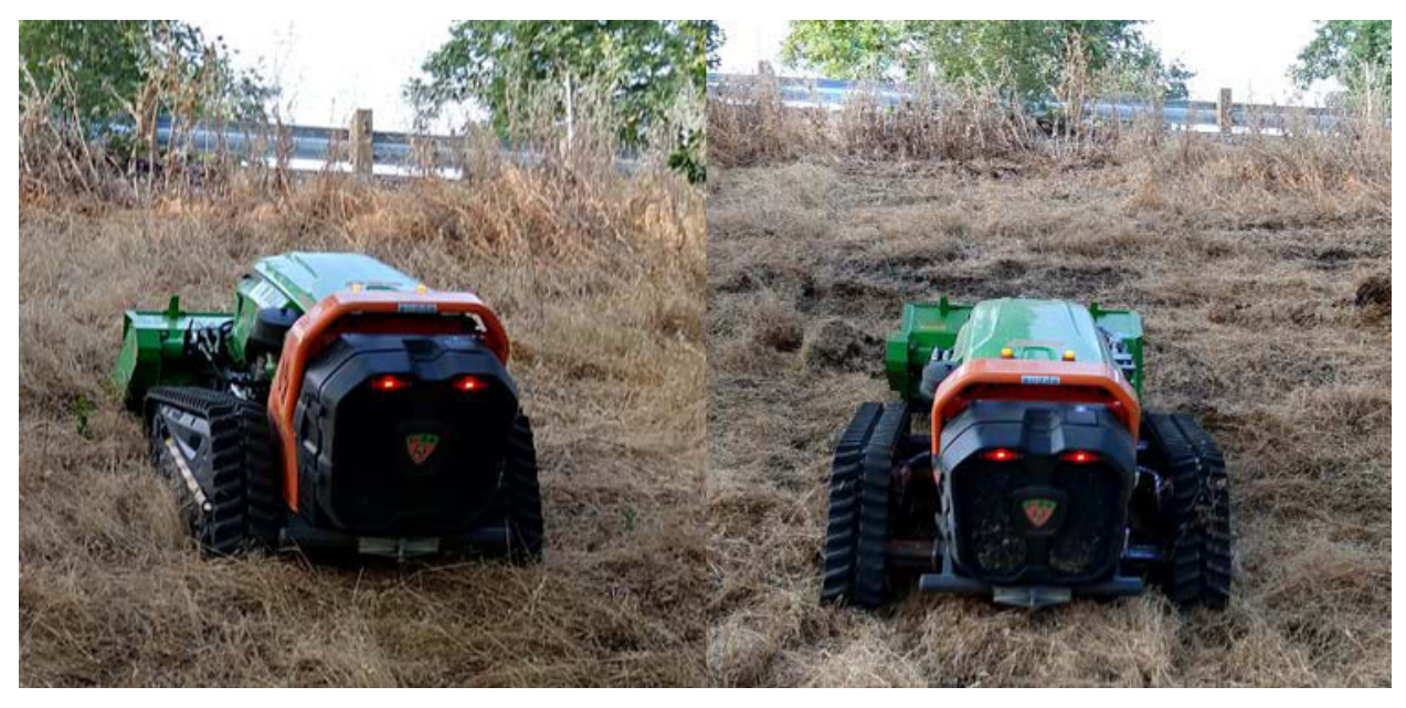
Figure 5.4: LV600 track widening function

Minimizing erosion while operating the mower on the slope was very difficult. To avoid the erosion, the steering action must be limited, which then limits maneuverability. When carefully driven in a straight line across slope, the erosion was minimized. When steering while mowing up slope as shown in Figure 5.5, the erosion was maximized.