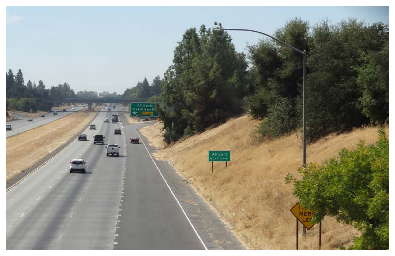
Figure 5.7 Below-grade cut section of SR 113 mowed by Woodland crew

During the course of testing, the mower was initially operated across the slope. After a track was thrown and the mower was returned to service, the mower was operated up and down slope as shown in Figure 5.8 and Figure 5.9. The operator mowed a strip in the downward direction, raised the cutter head, and backed up the slope.