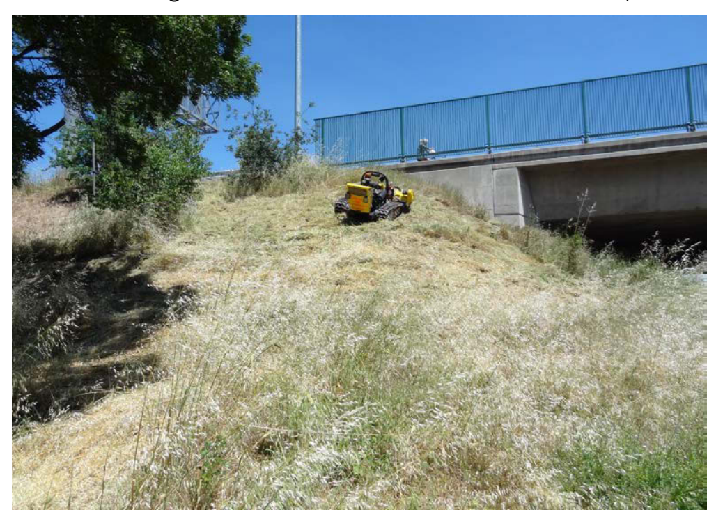
Figure 4.2: Traxx on slope transition from 2:1 (27°) to 1.5:1 (34°) under roadway

The one negative anomaly observed during the demonstration was how, in one instance, the Traxx broke through the surface and tore holes into the ground. This occurred as the Traxx was mowing up a slope approaching 2:1 (27°). The weight of the machine was clearly transferred to the rear of the tracks, and once it broke through the surface crust, it could not maintain enough traction to move forward. The operator indicated that he normally attempts to drive the machine across steep slopes when possible. The operators emphasized that disturbed ground allows weeds to establish, which is problematic.