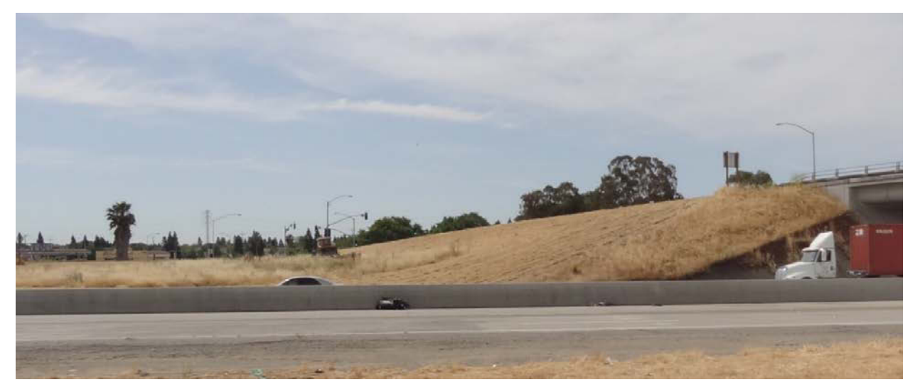
Figure 4.7: Mowing operation with a large batwing mower

One advantage in operating machines like the AEBI and a tractor over the RCM is that the operator can be enclosed in an air-conditioned cab with reduced exposure to dust. Another factor that should be considered is that large CMs are often driven on the shoulder or on surface streets when moving between locations. This reduces the need to trailer the mower.