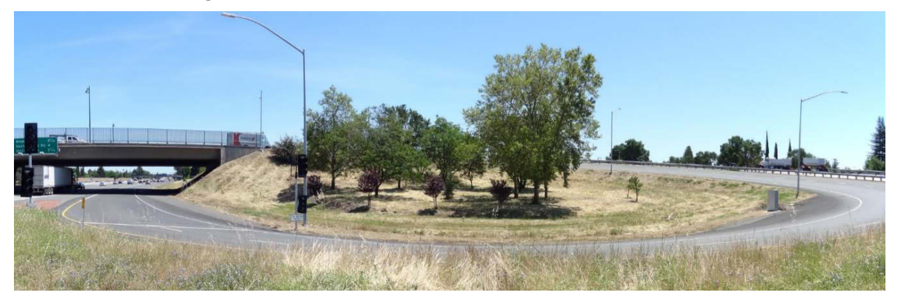
Figure 4.4: Landscaped area mowed with Traxx (SR 50 & Watt, SW quadrant)

The crew successfully used the Traxx to mow several large areas, such as the quadrant shown in Figure 4.4. Given the relatively wide-open sections, the operators would have preferred to use their riding slope mower which has a larger cut width. However, the riding slope mower, described in the following section, was being repaired at the time.