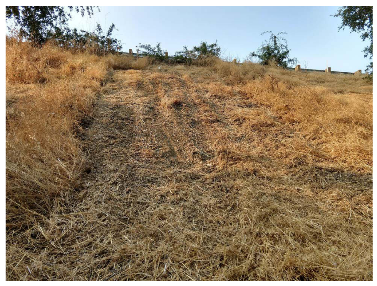
Figure 5.6: Close-up view of erosion on ground without mulch