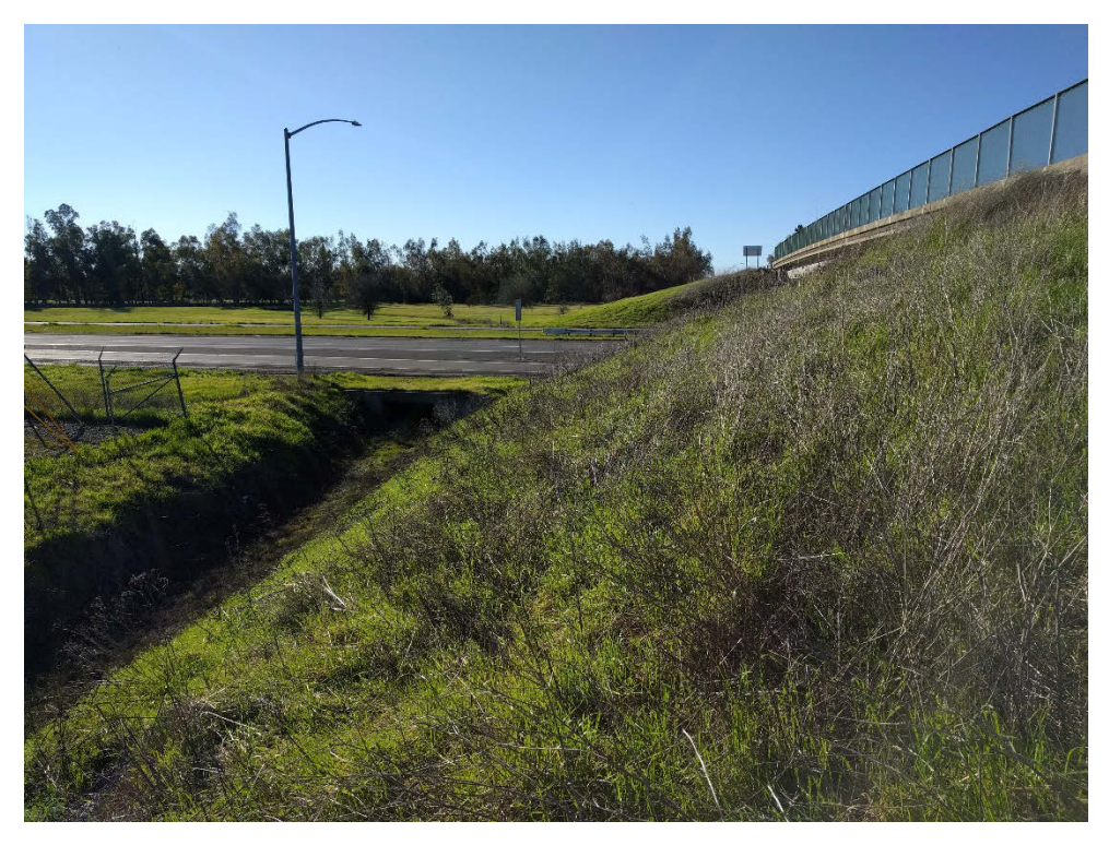
Figure 4.13: Slopes 1:1 (45°) in drainage (SR 113 and County Road 29 SE quadrant)