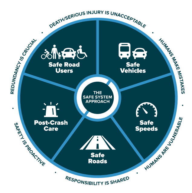
Figure 1: Safe System Approach Principles and Key Elements<sup>1</sup>

Consistent with national best practice, Caltrans has set a state Vision Zero policy and has embraced the Safe System approach consistent with that. In 2022, Caltrans enacted Director's Policy 36 (DP-36), with the intent of establishing a corporate expectation to prioritize safety to achieve the agency's goal of zero fatalities and serious injuries by 2050<sup>2</sup>.