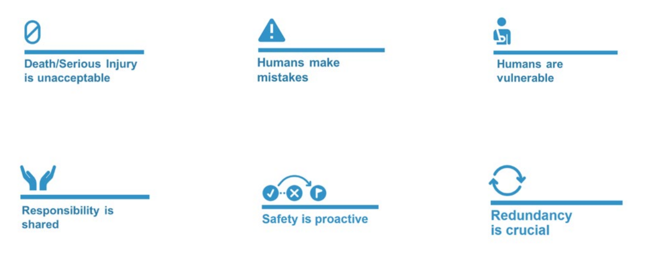
Figure 2: Safe System Principles<sup>4</sup>

To support the pivot to the Safe System approach, and based on recommendations from the Zero Fatalities Task Force<sup>3</sup>, Caltrans is exploring a range of Safe System strategies for potential adoption. One such strategy is setting speed limits based on multi-modal and land use context rather than the 85<sup>th</sup> percentile of current motorist speeds. This report explores examples of agencies that have taken a Safe System Approach to speed limit setting through strategies that paired speed limit changes with complementary signage, design, enforcement, or educational efforts. For case studies in which evaluation data was published, this report includes discussion of the outcomes of those interventions as they relate to speed reduction and other metrics reported by the agency.