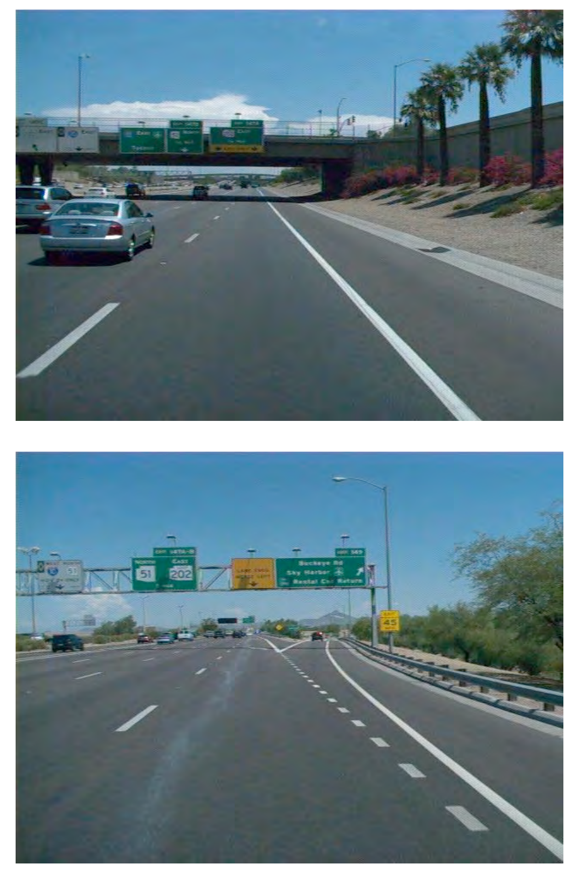
This a sign with the larger route shields and legends as proposed in the new MUTCD.