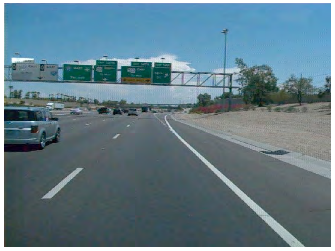
The sign in yellow is "Exit Only." Auxiliary-lane striping begins at the point of this sign.