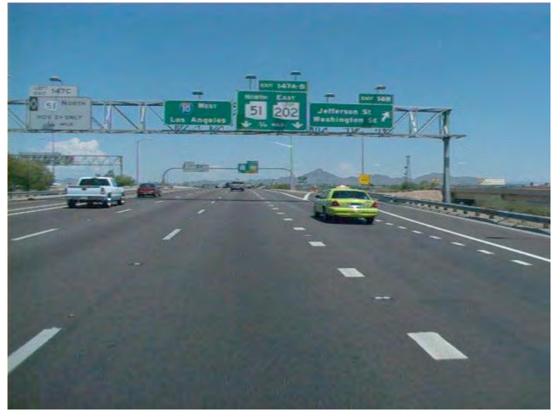
I-10 West showing larger route shields for Interchange routes.