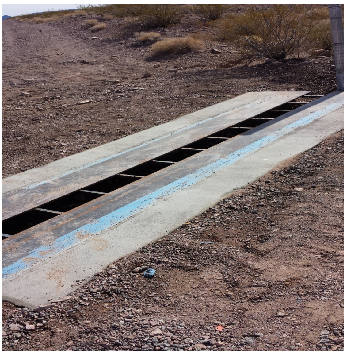
Figure 2. Permanent one-slot tortoise guard installed on a dirt road in Nevada. Note the escape route and connection to tortoise proof fence on the far side of the guard.

One-slot guards may either be permanently or temporarily installed. Permanent guards are constructed more robustly and fixed to a concrete foundation while temporary guards are installed on a temporary foundation. The robustness of the foundation for a tortoise guard depends on the on the traffic volume and the types of vehicles that are expected to cross it. Where traffic volumes are high or more heavy vehicles are expected the installation needs to be more robust. Details of construction for a permanent one-slot tortoise guard are in Figure 1. This same figure is also presented in Grandmaison et al. (2012) on page 86 as well as Attachment B of the Ivanpah Biological Assessment (CH2MHill 2009). A permanent one-slot tortoise guard emplaced across a dirt road in Nevada is shown in Figure 2. Construction details for a temporary tortoise guard are shown in Figure 3, while a picture of a temporary installation is Figure 4.