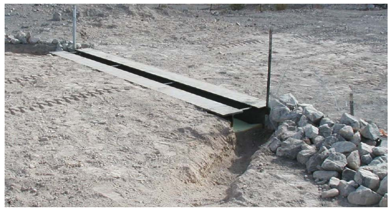
Figure 4. Installed temporary one-slot tortoise guard and fence. Note the escape ramps.