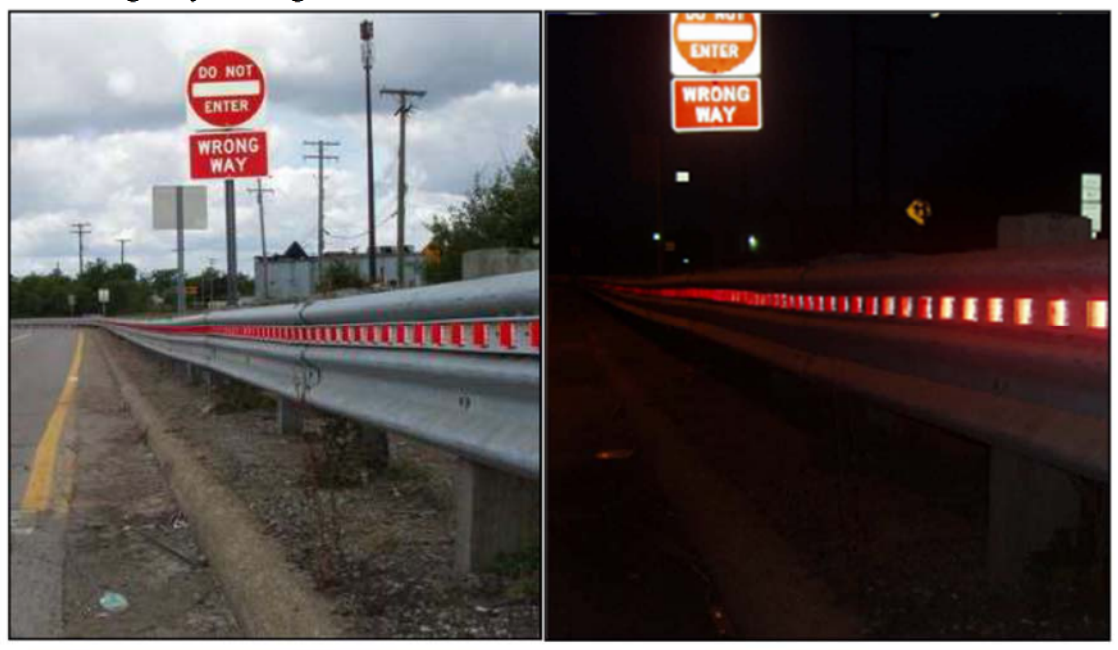
Figure 3: "Do Not Enter" and "Wrong-way" Sign in conjunction with barrier delineator that is visible when going the wrong-way.