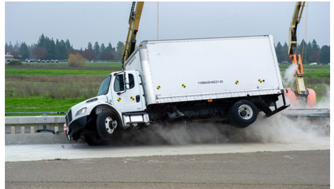
Image 7: 10000S (Single-Unit Truck) test on Type 86H Concrete Barrier Rail Looking East