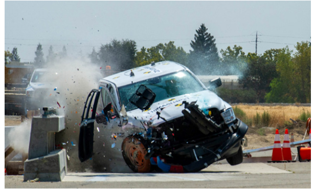
Image 6: 2270P (pickup) test on Type 86H Concrete Barrier Rail Looking South