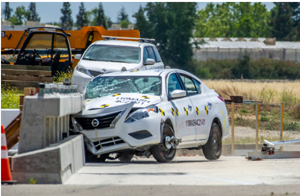
Image 5: 1100C (Passenger Car) test on Type 86H Concrete Barrier Rail Looking South