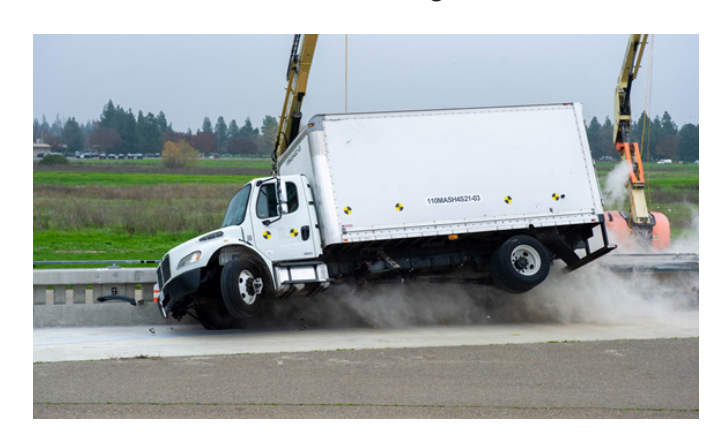
Image 7: 10000S (Single-Unit Truck) test on Type 86H Concrete Barrier Rail Looking East