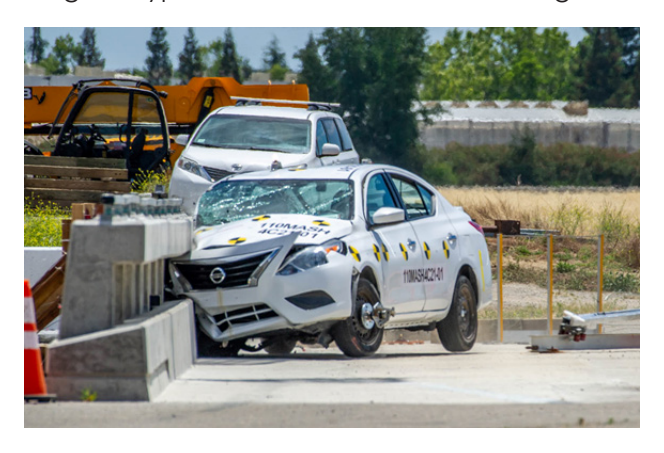
Image 5: 1100C (Passenger Car) test on Type 86H Concrete Barrier Rail Looking South