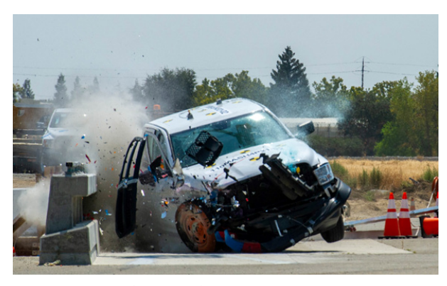
Image 6: 2270P (pickup) test on Type 86H Concrete Barrier Rail Looking South