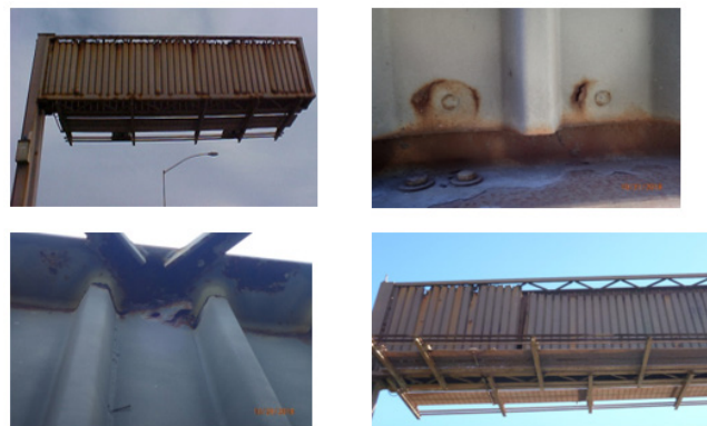
Image 1: Typical corrosion damage of in-service box beam sign structures