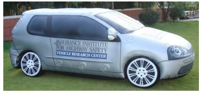
Image 2: Example of Obstacle for Testing (Inflatable Car with Foil Inserts)

The contents of this document reflect the views of the authors, who are responsible for the facts and accuracy of the data presented herein. The contents do not necessarily reflect the official views or policies of the California Department of Transportation, the State of California, or the Federal Highway Administration. This document does not constitute a standard, specification, or regulation. No part of this publication should be construed as an endorsement for a commercial product, manufacturer, contractor, or consultant. Any trade names or photos of commercial products appearing in this document are for clarity only.