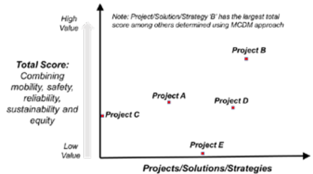
Figure 1: Multi-criteria decision-making (MCDM) approach with outcomes, which helps make recommendations for optimal solutions for corridor planning.