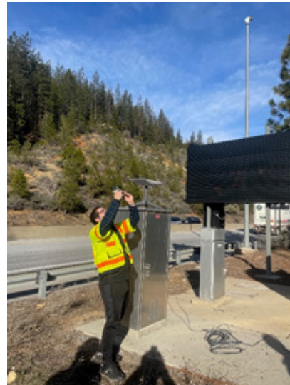
Image 1: Image shows researcher determining best orientation for satellite dish while testing equipment at a field site