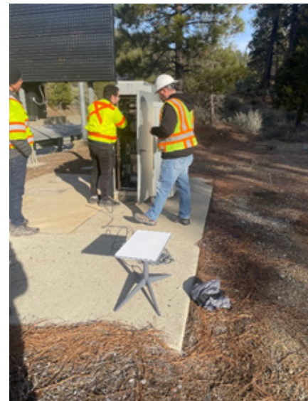
Image 2: Image show researcher connecting satellite equipment to field site for testing

The contents of this document reflect the views of the authors, who are responsible for the facts and accuracy of the data presented herein. The contents do not necessarily reflect the official views or policies of the California Department of Transportation, the State of California, or the Federal Highway Administration. This document does not constitute a standard, specification, or regulation. No part of this publication should be construed as an endorsement for a commercial product, manufacturer, contractor, or consultant. Any trade names or photos of commercial products appearing in this document are for clarity only.