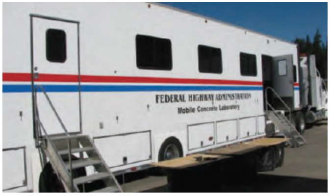
Figure 2: Mobile research laboratory supporting the on-site project