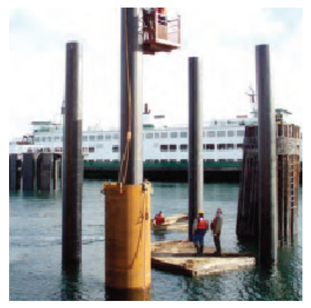
IMAGE 1: Surrounding a 30-inch-diameter pile with a temporary double-walled steel tube to suppress noise