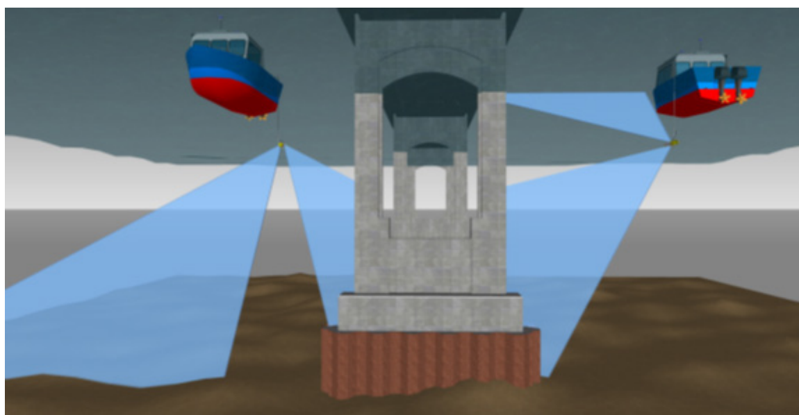
Figure 2. Side-scan sonar mounting positions for structural imaging (right) and bottom scanning (left).

The contents of this document reflect the views of the authors, who are responsible for the facts and accuracy of the data presented herein. The contents do not necessarily reflect the official views or policies of the California Department of Transportation, the State of California, or the Federal Highway Administration. This document does not constitute a standard, specification, or regulation. No part of this publication should be construed as an endorsement for a commercial product, manufacturer, contractor, or consultant. Any trade names or photos of commercial products appearing in this document are for clarity only.