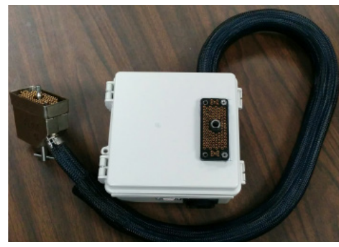
Figure 1: C1 Reader/Analyzer in Environmental Enclosure (closed)