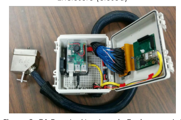
Figure 2: C1 Reader/Analyzer in Environmental Enclosure (open)d