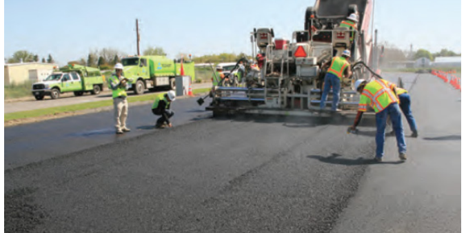
Figure 1: Rubberized warm mix asphalt paving at the Pavement Research Center