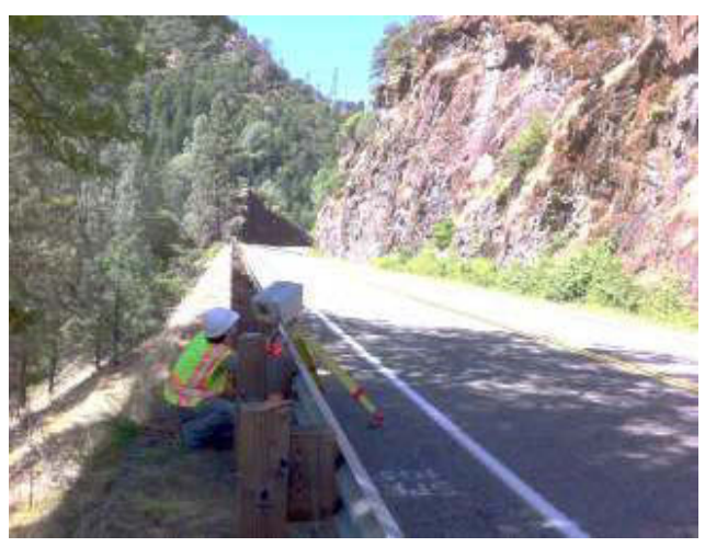
Image 2: Difficult Scanning from across a Narrow Highway at the California Site.