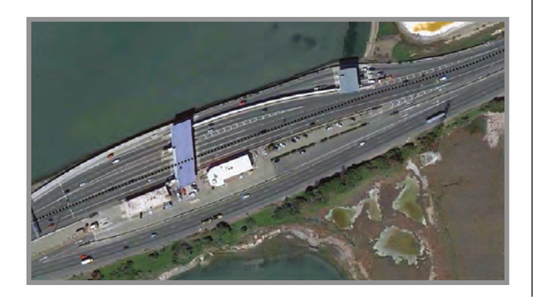
Magnet track at San Mateo Toll Plaza

The research team conducted on-road system testing without passengers and in revenue service with passengers.