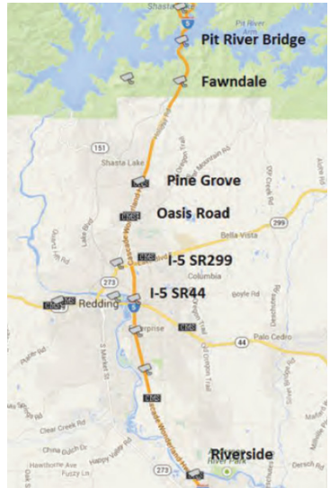
Figure 1: Chain-up delay tracking for trucks using Bluetooth wireless technology on I-5 north of Redding developed during COATS Phase V.