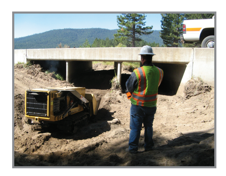
Operator controlling loader. Fletcher Creek, Highway 89, District 3

As of 2011, the tunnel mucker has been used in Districts 3, 4, 5, 6, 7, 8, 9, 10, and 11. The equipment has been well received by maintenance crews. As a result of this research project, Maintenance Statewide Equipment Managers has requested acquiring three more culvert cleaning units to use statewide.