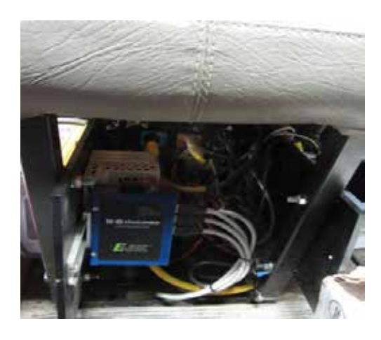
Figure 4: UM DAS computer installed underneath passenger seat

The contents of this document reflect the views of the authors, who are responsible for the facts and accuracy of the data presented herein. The contents do not necessarily reflect the official views or policies of the California Department of Transportation, the State of California, or the Federal Highway Administration. This document does not constitute a standard, specification, or regulation. No part of this publication should be construed as an endorsement for a commercial product, manufacturer, contractor, or consultant. Any trade names or photos of commercial products appearing in this document are for clarity only.