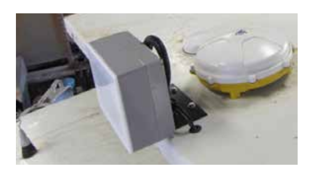
Figure 3: Radar, modem and GNSS antenna installed on top of a snowplow cab protector