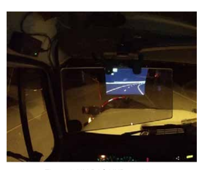
Figure 1: UM DAS HUD combiner

http://ahmct.ucdavis.edu/pdf/UCD-ARR-15-08-30-01.pdf