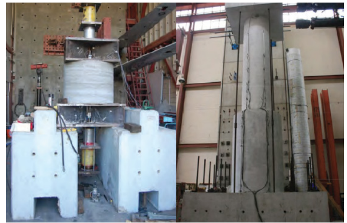
Figure 1: Bond-slip test Figure 2: Column-shaft assembly instrumented