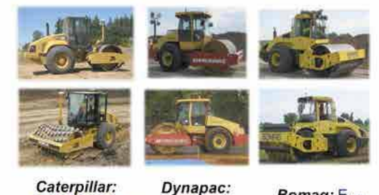
CMV, RMV, MDP