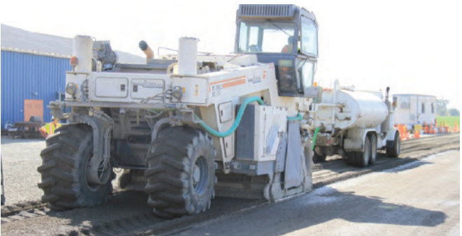
Figure 1: FDR with cement on a test track at UC Davis