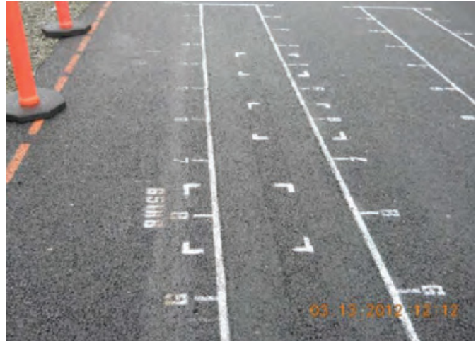
Figure 2: Georgia 1/2-inch mix with PG 58-34PM; OGFC thickness = 0.15 feet