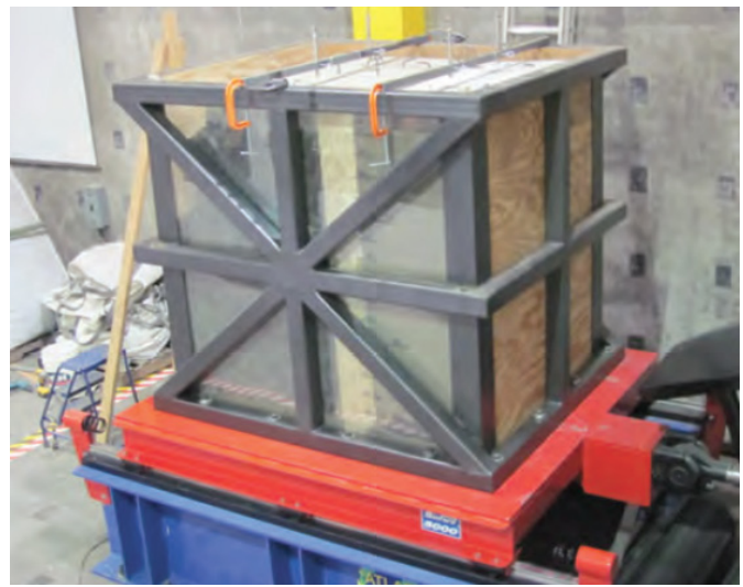
Figure 1: Shake table test of an MSE wall