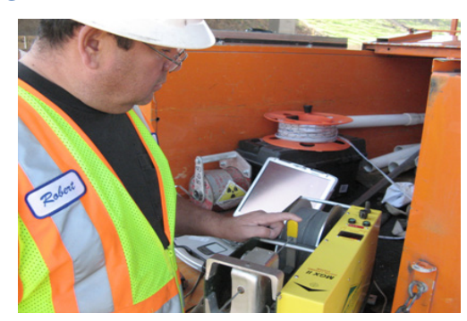
FIGURE 1: Mount Sopris Testing Equipment: Winch and Computer