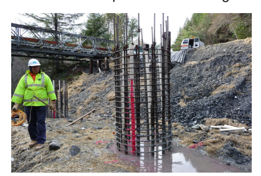
FIGURE 4: Example of GGL Testing Site