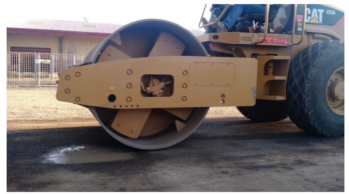
Image 2: Roller microcracking the newly cemented base at 24 hours.