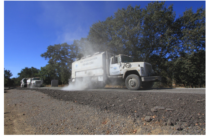
Image 1: Cement placement prior to being mixed into the asphalt and base