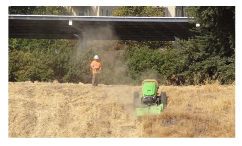
Figure 3: RCM mowing downward from top of 2:1 slope

Figure 2: Mowers on typical roadside slopes