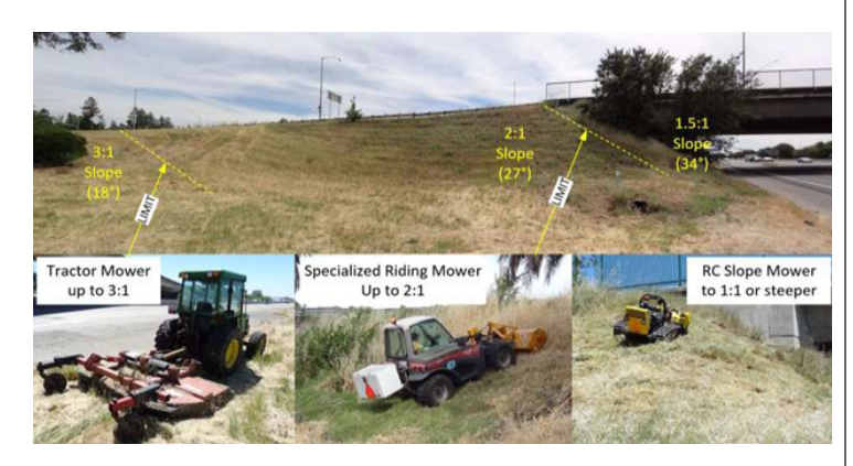
Figure 2: Mowers on typical roadside slopes

Figure 1: Guide showing slopes and conditions relevant to mower equipment selection