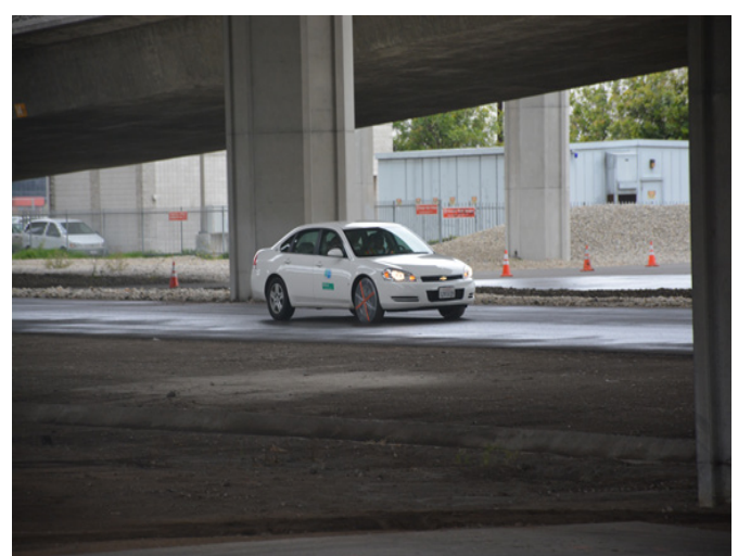
Car durability test on the track