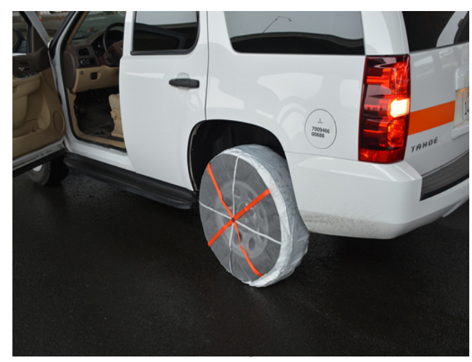
SUV with the cloth tire traction control device installed on the rear wheels