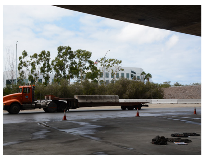
Semi-truck with trailer durability test on the track