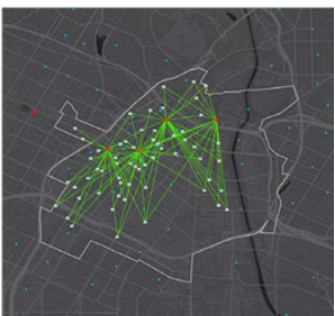
Image 1: A Network for Bike sharing, P2P ridesharing, and LA Metro Red Line stations