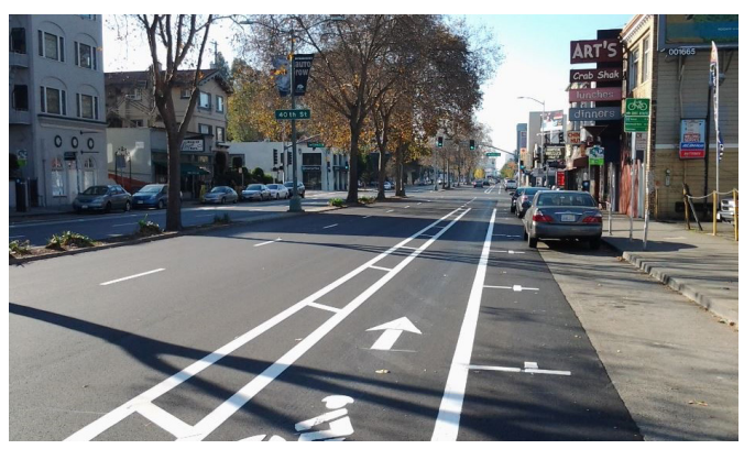
Figure 1: Example of Class II Facility: Broadway, Oakland