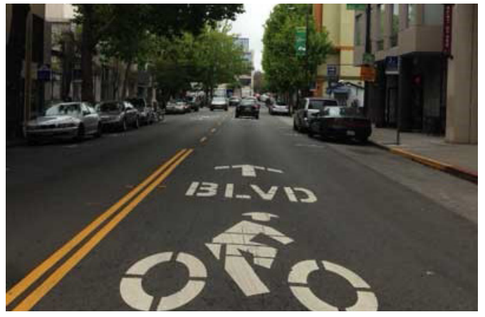
Figure 2: Example of Class III Facility: Milvia Street, Berkeley