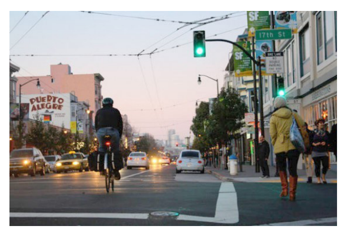
Figure 3: Valencia Street