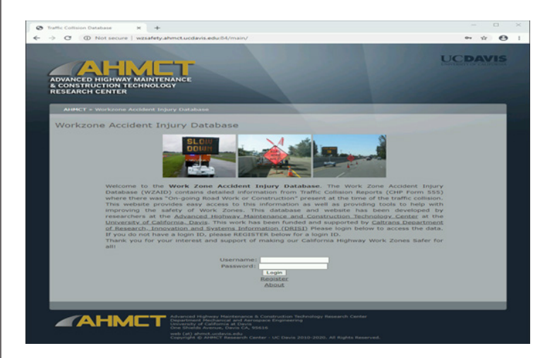
Figure 1: AHMCT work zone collision database web portal