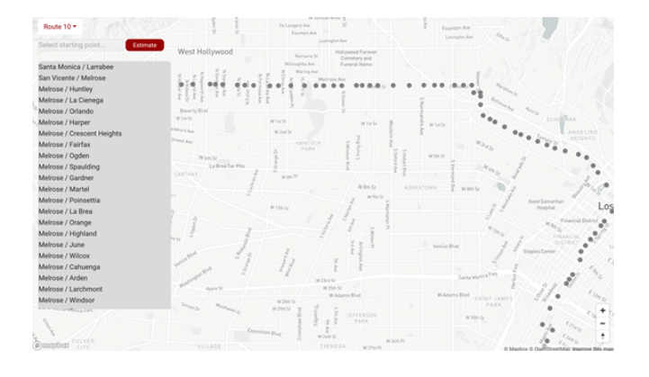
Image 2: Screenshot of the tool showing the bus stops on the chosen route.

Image 1: Screenshot of the tool showing the route choices.